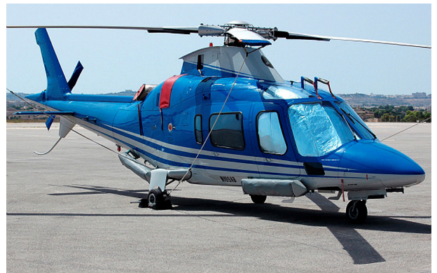
Agusta Power Cockpit HeatShields & Blade Tie-downs