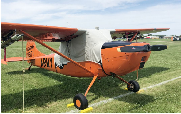
Cessna L-19 Bird Dog Canopy Cover

This cover type is made from Silver Acrylic Sunbrella canvas and is 100% lined with a soft and smooth microfiber. Bruce's Custom Covers developed this material combination especially for aircraft protection. The outer material is medium weight and treated for water resistance, UV resistance and anti-static buildup. The inner lining is a very soft and smooth microfiber to prevent scratching. The material is very reflective, and tests show that the cabin interior temperature can be reduced to near-ambient temperature on the hottest of days. It is water, ice and snow repellent, yet breathable to allow moisture to escape from between the cover and the aircraft surface.