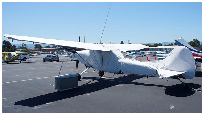
Cessna L-19 Extended Over-the-top Canopy, Engine, Empennage & Wing Covers

WINTER USE MATERIAL - Made with Solution-Dyed Polyester fabric, this option is intended for seasonal use to aid in deicing, rain mitigation, or for occasional travel. The material is lighter and more compact, but more susceptible to UV damage and may have a shorter useful life if used continuously outside than the all-year use material.