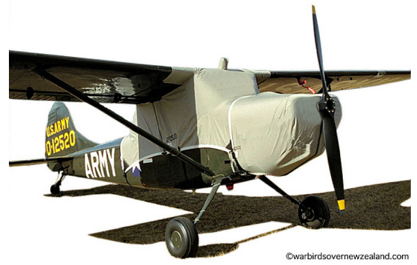
Cessna L-19 Canopy & Engine Covers