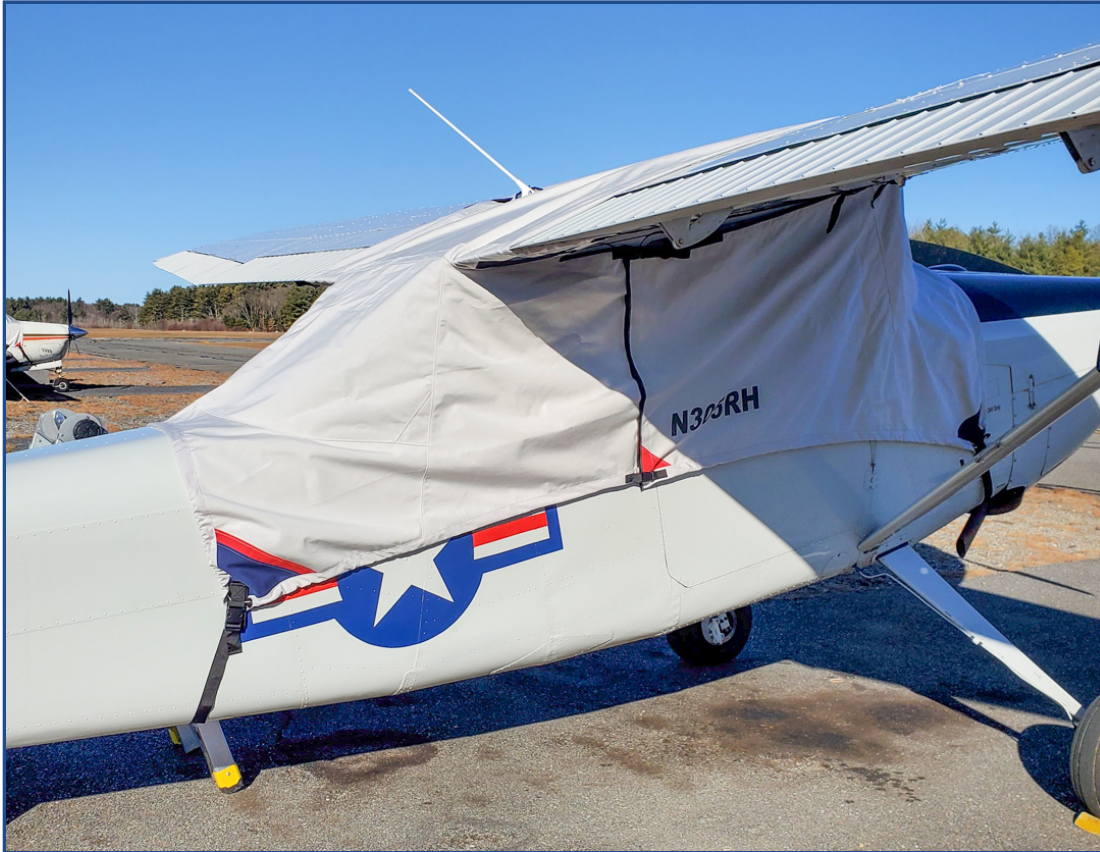
Cessna 305F Canopy Cover, over top type