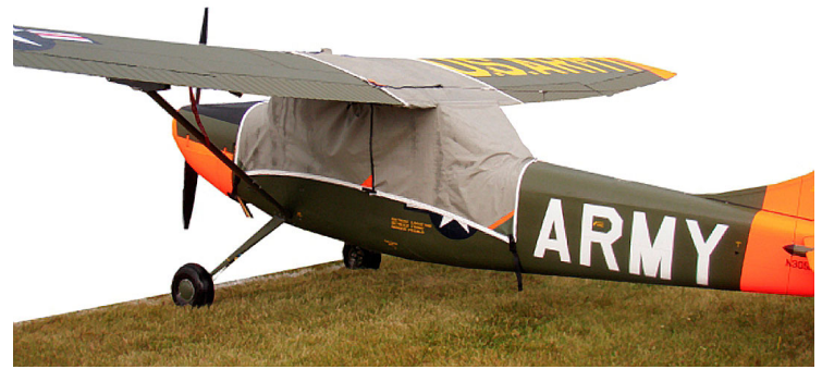
L-19 Canopy Cover