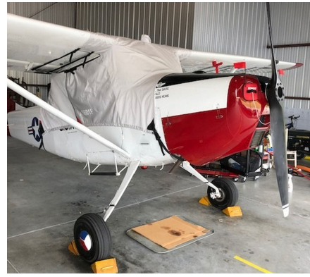
Cessna Bird Dog, L-19, O-1, 305 Canopy Cover, Over-Top Type Cessna Bird Dog, L-19, O-1, 305 Canopy Cover, Over-Top Type