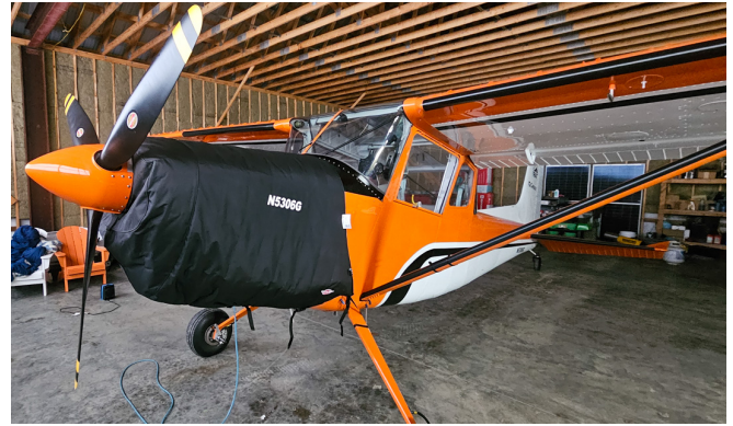
Cessna Bird Dog, L-19, O-1, 305 Insulated Engine Cover