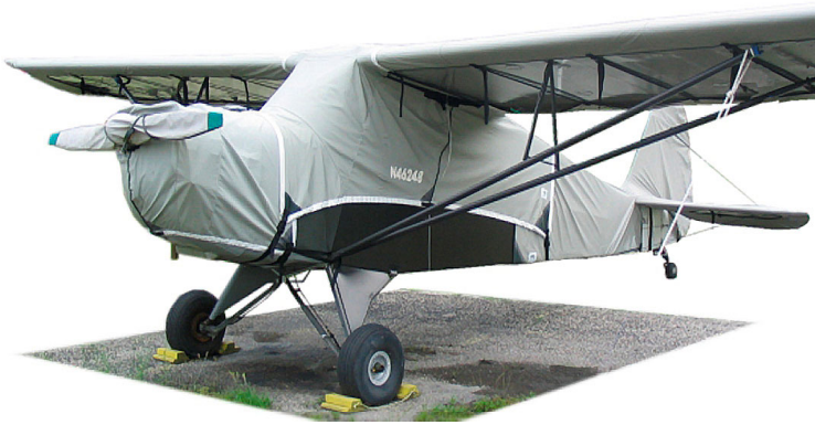
Prop Cover, Engine Cover, Canopy Cover, Wing Covers and Empennage Cover

WINTER USE MATERIAL - Made with Solution-Dyed Polyester fabric, this option is intended for seasonal use to aid in deicing, rain mitigation, or for occasional travel. The material is lighter and more compact, but more susceptible to UV damage and may have a shorter useful life if used continuously outside than the all-year use material.