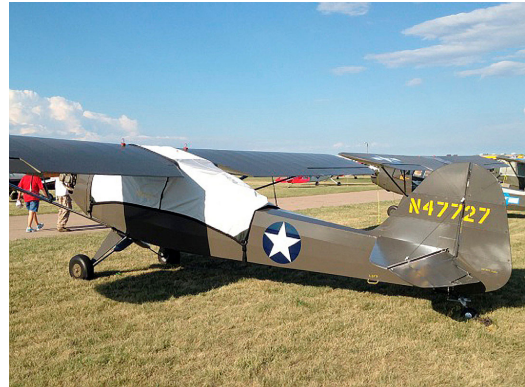
Taylorcraft L-2 Canopy Cover