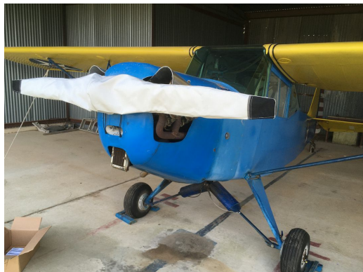
Taylorcraft L-2 Grasshopper Propellor/Spinner Cover

This cover type is made from Silver Acrylic Sunbrella canvas and is 100% lined with a soft and smooth microfiber. Bruce's Custom Covers developed this material combination especially for aircraft protection. The outer material is medium weight and treated for water resistance, UV resistance and anti-static buildup. The inner lining is a very soft and smooth microfiber to prevent scratching. The material is very reflective, and tests show that the cabin interior temperature can be reduced to near-ambient temperature on the hottest of days. It is water, ice and snow repellent, yet breathable to allow moisture to escape from between the cover and the aircraft surface.