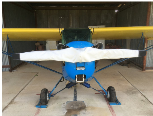
Taylorcraft L-2 Grasshopper Propellor/Spinner Cover