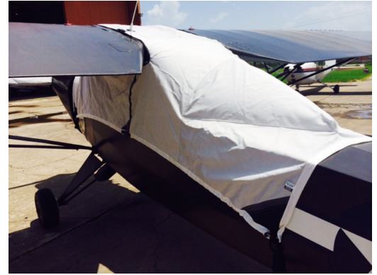
Taylorcraft L-2 Canopy Cover