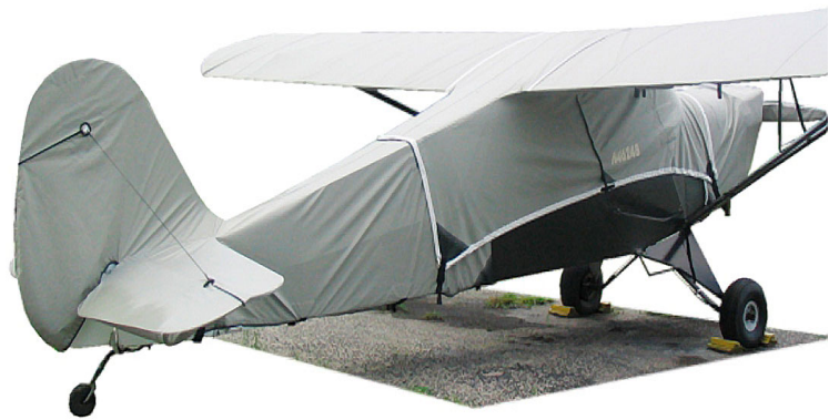
Taylorcraft L-2 Grasshopper Prop, Engine, Canopy, Wing and Empennage Covers