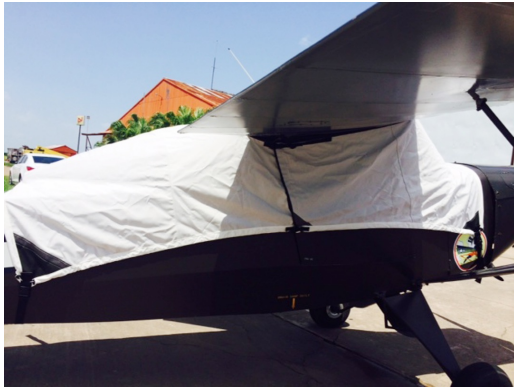
Taylorcraft L-2 Canopy Cover

This cover type is made from Silver Acrylic Sunbrella canvas and is 100% lined with a soft and smooth microfiber. Bruce's Custom Covers developed this material combination especially for aircraft protection. The outer material is medium weight and treated for water resistance, UV resistance and anti-static buildup. The inner lining is a very soft and smooth microfiber to prevent scratching. The material is very reflective, and tests show that the cabin interior temperature can be reduced to near-ambient temperature on the hottest of days. It is water, ice and snow repellent, yet breathable to allow moisture to escape from between the cover and the aircraft surface.