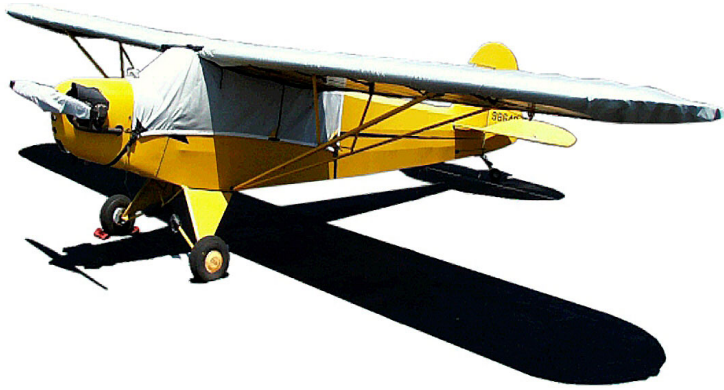
Piper J3 Canopy, Wing and Prop Covers

This cover type is made from Silver Acrylic Sunbrella canvas and is 100% lined with a soft and smooth microfiber. Bruce's Custom Covers developed this material combination especially for aircraft protection. The outer material is medium weight and treated for water resistance, UV resistance and anti-static buildup. The inner lining is a very soft and smooth microfiber to prevent scratching. The material is very reflective, and tests show that the cabin interior temperature can be reduced to near-ambient temperature on the hottest of days. It is water, ice and snow repellent, yet breathable to allow moisture to escape from between the cover and the aircraft surface.