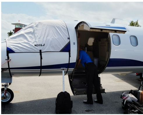
Lear 31A Cockpit Cover