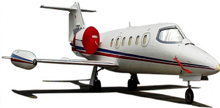
Lear 35 Engine Covers, Pitot Covers & Cockpit HeatShields

The Lear 24 & 25 Bikini Style Engine Covers are a single-piece design using a soft and smooth stretchy and fabric. The cover stretches tightly over both the intake and exhaust, installing quickly and easily. These covers are designed to be used as hangar dust covers and have a useful life of approximately one year.