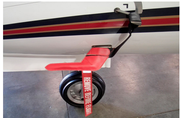
Learjet Heat Resistant Pitot Cover and AOA Strap