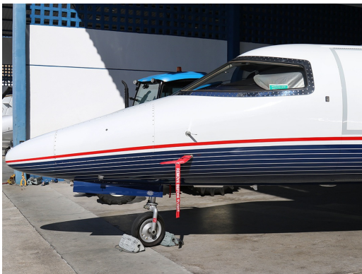
Lear Pitot Cover

The Engine Inlet Plugs are custom fit for your Lear 24 & 25 intakes, made with heavy-duty vinyl material, and stuffed with a single block of sculpted urethane foam. Each plug has a zipper that allows the foam to be removed and dried if necessary. Engine plugs have 'remove before flight' streamers sewn onto the face of the plugs. Most plugs are imprinted with the aircraft registration number in black for an extra charge. Storage bag NOT included. Engine plugs may be inserted after flight when the engine is still warm. Engine Inlet Plugs are commonly referred to as Cowl Plugs, Intake Plugs, Cowl Blocks, Engine Blocks, and Engine Bungs.