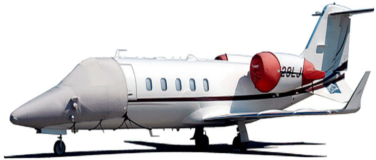
Lear 45 Windshield/Nose & Engine Cover Set