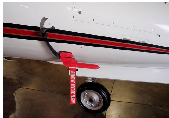
Learjet Heat Resistant Pitot Cover with AOA strap