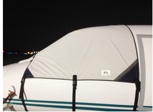
Lear 31 Cockpit Cover