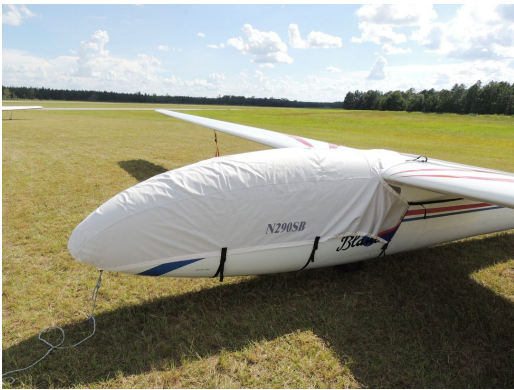
Blanik L23 Canopy/Nose Cover, All Year Use