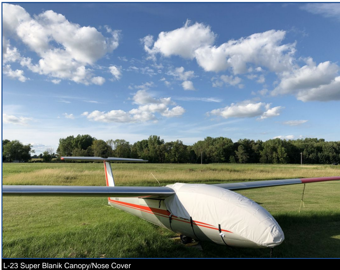
L-23 Super Blanik Canopy/Nose Cover