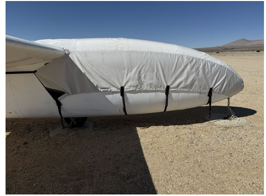
Blanik L-23 Canopy/Nose Cover