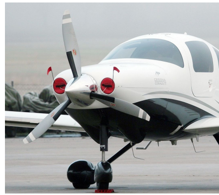
Cessna Corvalis, Corvalis TT, Models T240, 350 &amp; 400 Engine Inlet Plugs, 400/Ttx Models