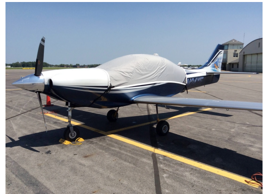
Lancair IV Light Weight Travel Canopy Cover