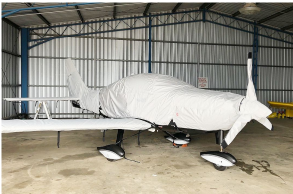
Columbia 350 Full Cover Set

WINTER USE MATERIAL - Made with Solution-Dyed Polyester fabric, this option is intended for seasonal use to aid in deicing, rain mitigation, or for occasional travel. The material is lighter and more compact, but more susceptible to UV damage and may have a shorter useful life if used continuously outside than the all-year use material.