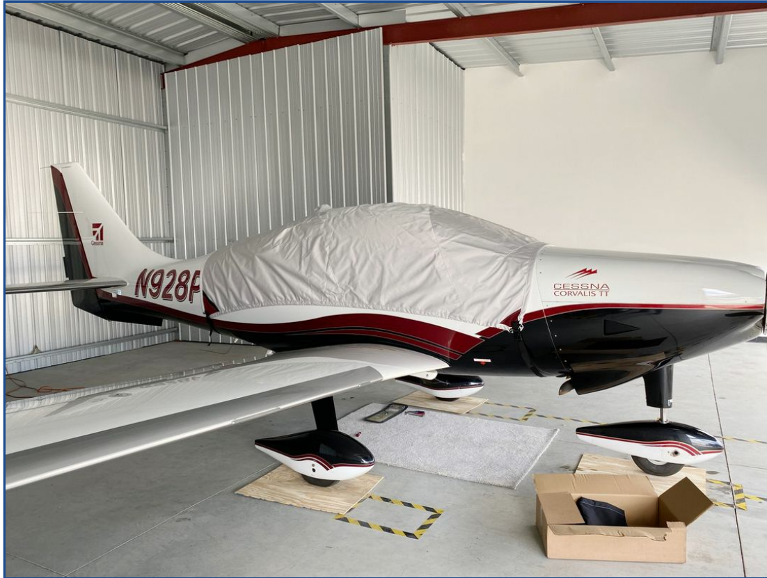
Corvalis TT 400 Canopy Cover