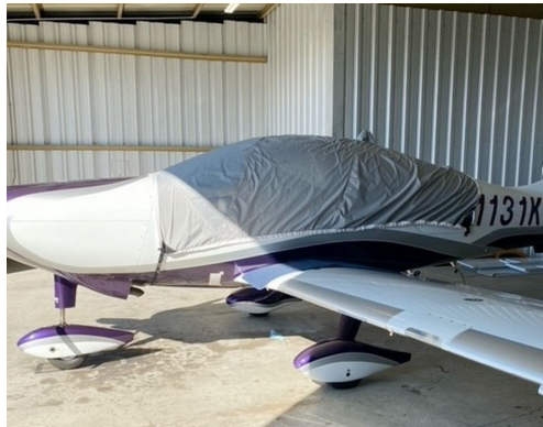
Lancair Columbia 400 Travel Canopy Cover