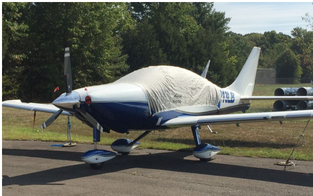
Lancair Columbia 350 Canopy Cover

This cover type is made from Silver Acrylic Sunbrella canvas and is 100% lined with a soft and smooth microfiber. Bruce's Custom Covers developed this material combination especially for aircraft protection. The outer material is medium weight and treated for water resistance, UV resistance and anti-static buildup. The inner lining is a very soft and smooth microfiber to prevent scratching. The material is very reflective, and tests show that the cabin interior temperature can be reduced to near-ambient temperature on the hottest of days. It is water, ice and snow repellent, yet breathable to allow moisture to escape from between the cover and the aircraft surface.