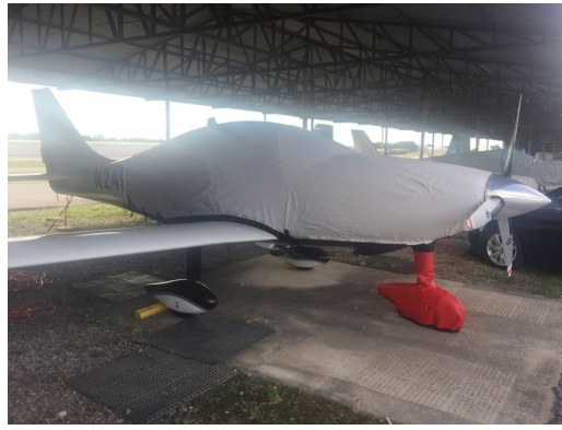
Lancair Columbia Extended Canopy/Engine Cover, Nose Wheelpant Cover