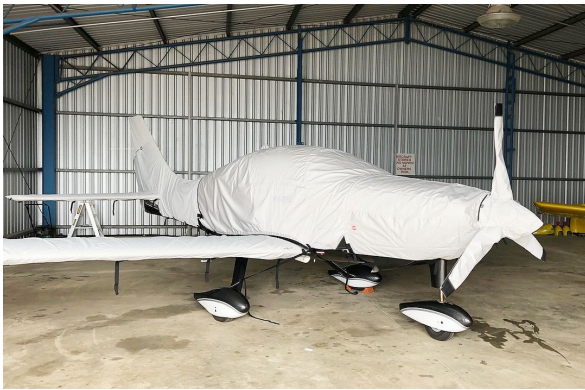
Columbia 350 Full Cover Set

This cover type is made from Silver Acrylic Sunbrella canvas and is 100% lined with a soft and smooth microfiber. Bruce's Custom Covers developed this material combination especially for aircraft protection. The outer material is medium weight and treated for water resistance, UV resistance and anti-static buildup. The inner lining is a very soft and smooth microfiber to prevent scratching. The material is very reflective, and tests show that the cabin interior temperature can be reduced to near-ambient temperature on the hottest of days. It is water, ice and snow repellent, yet breathable to allow moisture to escape from between the cover and the aircraft surface.