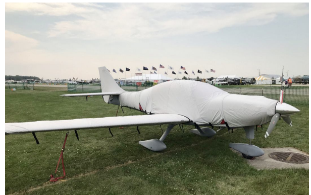
Lancair Columbia Complete Cover Set210