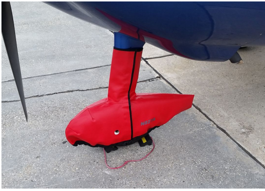
Lancair Columbia Nose Wheelpant/Strut Cover