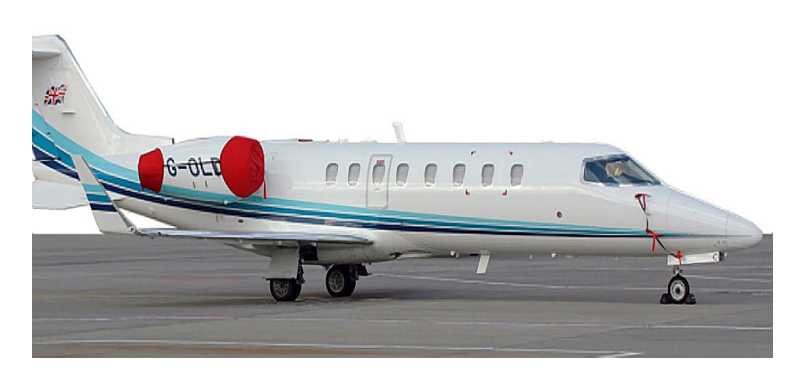
Lear 45 Engine Covers & Pitot Covers