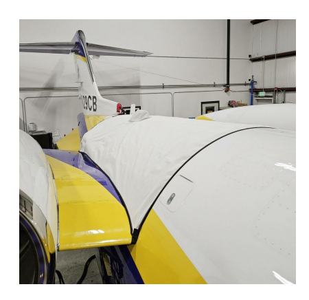
Lear 45 Empennage Saddle Cover W/ Dorsal Inlet Plug (Covers Upper Fuselage Between Pylons, Acm/Apu Area) Lear 45 Empennage Saddle Cover W/ Dorsal Inlet Plug (Covers Upper Fuselage Between Pylons, Acm/Apu Area)