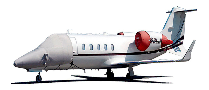
Lear 45 Windshield/Nose & Engine Cover Set