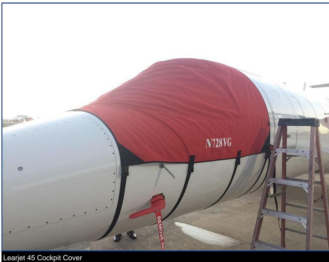
Learjet 45 Cockpit Cover