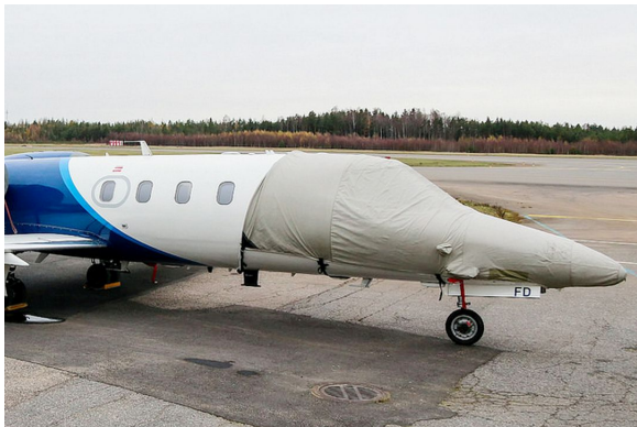
Learjet Cockpit/Nose Cover