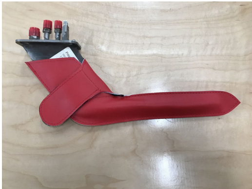
Lear 55 Pitot Cover

The Engine Inlet Plugs are custom fit for your Lear 55 intakes, made with heavy-duty vinyl material, and stuffed with a single block of sculpted urethane foam. Each plug has a zipper that allows the foam to be removed and dried if necessary. Engine plugs have 'remove before flight' streamers sewn onto the face of the plugs. Most plugs are imprinted with the aircraft registration number in black for an extra charge. Storage bag NOT included. Engine plugs may be inserted after flight when the engine is still warm. Engine Inlet Plugs are commonly referred to as Cowl Plugs, Intake Plugs, Cowl Blocks, Engine Blocks, and Engine Bungs.