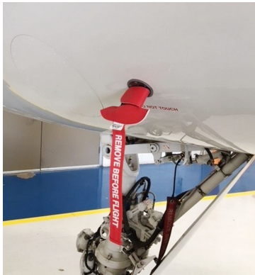
Grumman Gulfstream G-V Rosemont/TAT Cover