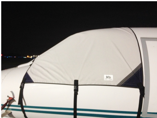
Lear 31 Cockpit Cover

This cover type is made from Silver Acrylic Sunbrella canvas and is 100% lined with a soft and smooth microfiber. Bruce's Custom Covers developed this material combination especially for aircraft protection. The outer material is medium weight and treated for water resistance, UV resistance and anti-static buildup. The inner lining is a very soft and smooth microfiber to prevent scratching. The material is very reflective, and tests show that the cabin interior temperature can be reduced to near-ambient temperature on the hottest of days. It is water, ice and snow repellent, yet breathable to allow moisture to escape from between the cover and the aircraft surface.