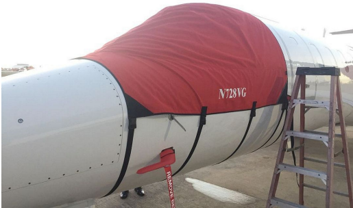
Learjet 45 Cockpit Cover