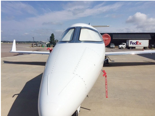
Lear Models 40 & 45 Cockpit Heatshields, Covers All Cockpit Windows

Cockpit Heatshields are interior sunshades for the aircraft's cockpit. The product is a unique composite of closed-cell foam with a silver mylar finish. The semi-rigid design is stiff enough to stand inside the window framing. The set folds up flat and is easily stored in the included storage sleeve. Some designs may require velcro and suction cups. Our Heatshields for jets are offered white side out because some aircraft manufacturers have issued advisories against reflective window inserts due to potential heat damage. A Heatshield is an excellent short-term remedy for cockpit overheating, but an external fabric cover is more effective for long-term protection.