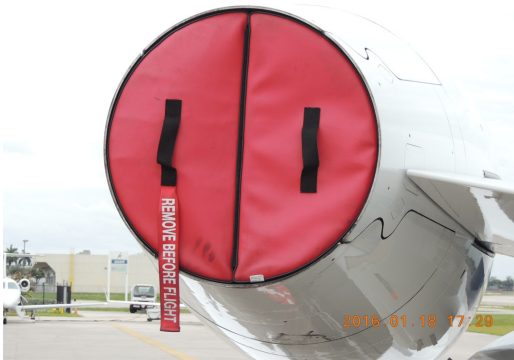
Embraer Legacy 500 Engine Exhaust Plug, folding type