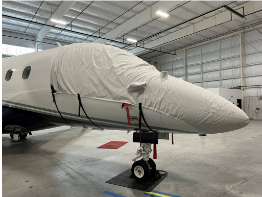
Embraer Legacy 500, (EMB-550) Cockpit/Nose Cover

This cover type is made from Silver Acrylic Sunbrella canvas and is 100% lined with a soft and smooth microfiber. Bruce's Custom Covers developed this material combination especially for aircraft protection. The outer material is medium weight and treated for water resistance, UV resistance and anti-static buildup. The inner lining is a very soft and smooth microfiber to prevent scratching. The material is very reflective, and tests show that the cabin interior temperature can be reduced to near-ambient temperature on the hottest of days. It is water, ice and snow repellent, yet breathable to allow moisture to escape from between the cover and the aircraft surface.