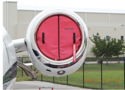
Embraer Legacy 500 Engine Inlet Plug, folding type