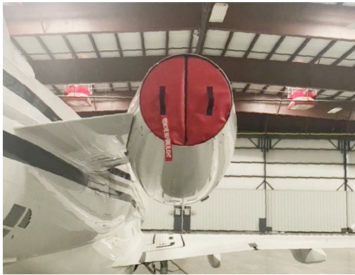
Embraer Legacy 500 Engine Exhaust Plugs, folding type

The Engine Inlet Plugs are custom fit for your Embraer Legacy 500 Praetor, (EMB-545/550) intakes, made with heavy-duty vinyl material, and stuffed with a single block of sculpted urethane foam. Each plug has a zipper that allows the foam to be removed and dried if necessary. Engine plugs have 'remove before flight' streamers sewn onto the face of the plugs. Most plugs are imprinted with the aircraft registration number in black for an extra charge. Storage bag NOT included. Engine plugs may be inserted after flight when the engine is still warm. Engine Inlet Plugs are commonly referred to as Cowl Plugs, Intake Plugs, Cowl Blocks, Engine Blocks, and Engine Bungs.