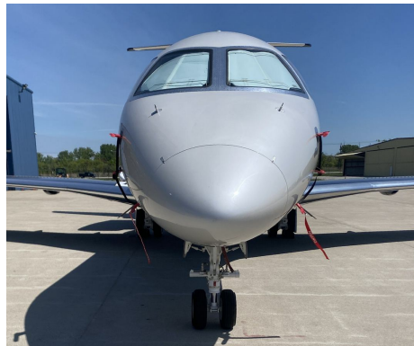
Embraer S A EMB-545 Pitot Cover Set, Cockpit HeatShields

Cockpit Heatshields are interior sunshades for the aircraft's cockpit. The product is a unique composite of closed-cell foam with a silver mylar finish. The semi-rigid design is stiff enough to stand inside the window framing. The set folds up flat and is easily stored in the included storage sleeve. Some designs may require velcro and suction cups. Our Heatshields for jets are offered white side out because some aircraft manufacturers have issued advisories against reflective window inserts due to potential heat damage. A Heatshield is an excellent short-term remedy for cockpit overheating, but an external fabric cover is more effective for long-term protection.