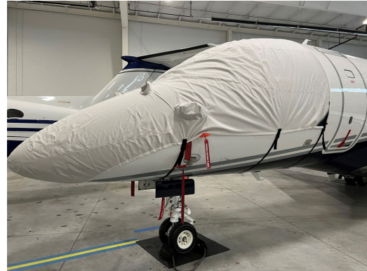
Embraer Legacy 500, (EMB-550) Cockpit/Nose Cover