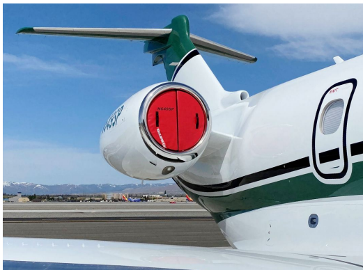
Embraer S A EMB-545 Engine Inlet & Exhaust Plug Set (folding type)

The Engine Inlet Plugs are custom fit for your Embraer Legacy 500 Praetor, (EMB-545/550) intakes, made with heavy-duty vinyl material, and stuffed with a single block of sculpted urethane foam. Each plug has a zipper that allows the foam to be removed and dried if necessary. Engine plugs have 'remove before flight' streamers sewn onto the face of the plugs. Most plugs are imprinted with the aircraft registration number in black for an extra charge. Storage bag NOT included. Engine plugs may be inserted after flight when the engine is still warm. Engine Inlet Plugs are commonly referred to as Cowl Plugs, Intake Plugs, Cowl Blocks, Engine Blocks, and Engine Bungs.