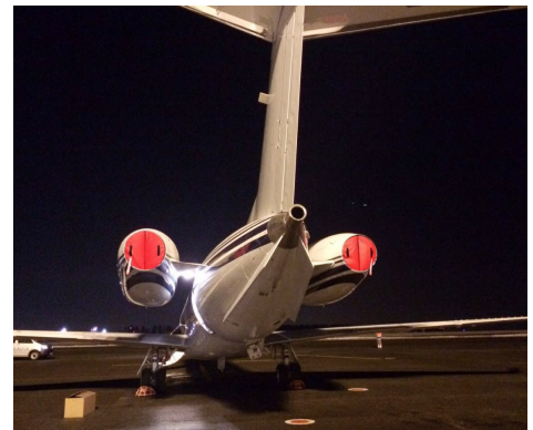
Embraer Legacy Exhaust Plugs