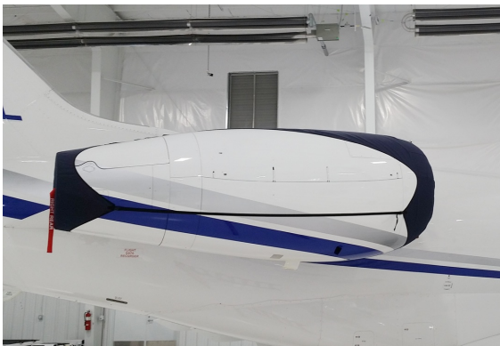
Challenger 300 Intake/Exhaust Cover Set, 3-strap type

The Embraer Legacy 500 Praetor, (EMB-545/550) Bikini Style Engine Covers are a single-piece design using a soft and smooth stretchy fabric. The cover stretches tightly over both the intake and exhaust, installing quickly and easily. These covers are designed to be used as hangar dust covers and have a useful life of approximately one year.