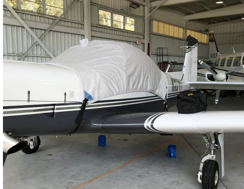
Valmet L-90 Canopy Cover

This cover type is made from Silver Acrylic Sunbrella canvas and is 100% lined with a soft and smooth microfiber. Bruce's Custom Covers developed this material combination especially for aircraft protection. The outer material is medium weight and treated for water resistance, UV resistance and anti-static buildup. The inner lining is a very soft and smooth microfiber to prevent scratching. The material is very reflective, and tests show that the cabin interior temperature can be reduced to near-ambient temperature on the hottest of days. It is water, ice and snow repellent, yet breathable to allow moisture to escape from between the cover and the aircraft surface.