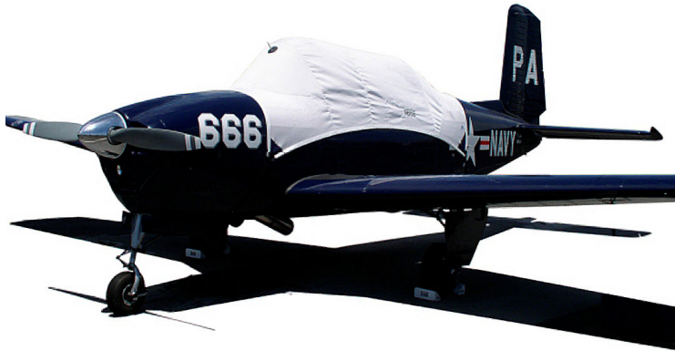
The T34 Canopy Cover

Travel Covers are made with Silver Solution-Dyed Polyester fabric and only lined over the windshield to save weight. The material is lightweight and more compact for easy stowage in the aircraft. The polyester material is water resistant, but only intended for occasional use outside. We also have an ultra lightweight material available for fitted hangar dust covers. For daily outdoor use, the non-travel Sunbrella Cover is the best choice.