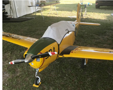
Beechcraft T-34B Mentor Canopy Cover, for 36% Scale Model