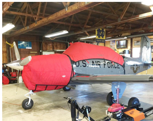
Beech T34 Mentor Canopy Cover, Insulated Engine Cover