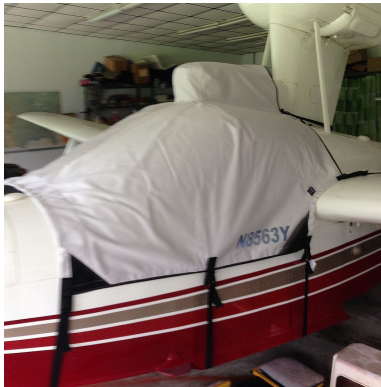
1985 LAKE LA-4-200 Canopy Cover

This cover type is made from Silver Acrylic Sunbrella canvas and is 100% lined with a soft and smooth microfiber. Bruce's Custom Covers developed this material combination especially for aircraft protection. The outer material is medium weight and treated for water resistance, UV resistance and anti-static buildup. The inner lining is a very soft and smooth microfiber to prevent scratching. The material is very reflective, and tests show that the cabin interior temperature can be reduced to near-ambient temperature on the hottest of days. It is water, ice and snow repellent, yet breathable to allow moisture to escape from between the cover and the aircraft surface.