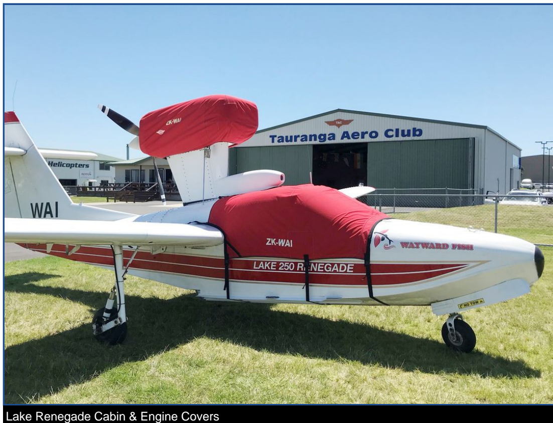
Lake Renegade Cabin &amp; Engine Covers