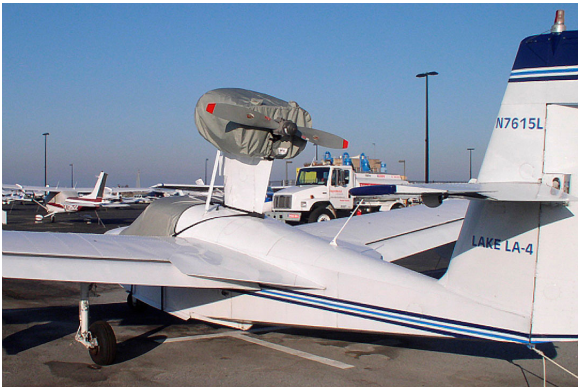
Lake Canopy & Engine Covers