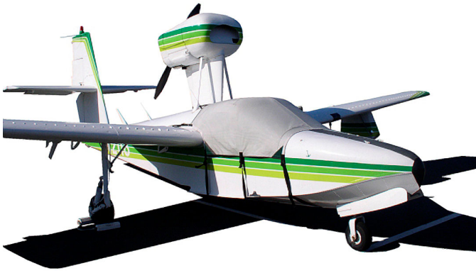
Lake LA-250 Canopy Cover