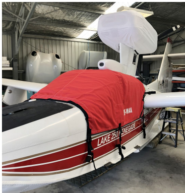
Lake LA250 Renegade Cockpit Cover, Engine Cover (test fit)