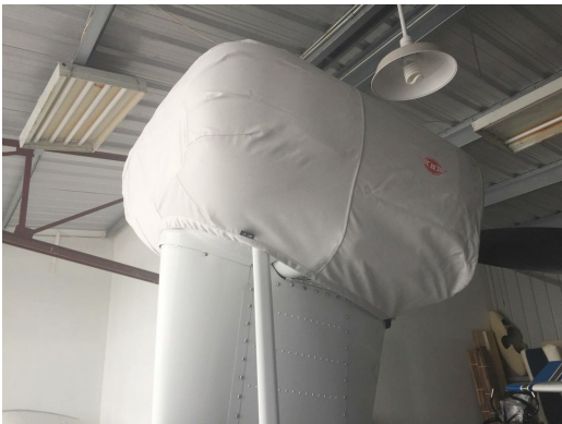
Lake LA-4 Buccaneer Engine Cover

This cover type is made from Silver Acrylic Sunbrella canvas and is 100% lined with a soft and smooth microfiber. Bruce's Custom Covers developed this material combination especially for aircraft protection. The outer material is medium weight and treated for water resistance, UV resistance and anti-static buildup. The inner lining is a very soft and smooth microfiber to prevent scratching. The material is very reflective, and tests show that the cabin interior temperature can be reduced to near-ambient temperature on the hottest of days. It is water, ice and snow repellent, yet breathable to allow moisture to escape from between the cover and the aircraft surface.