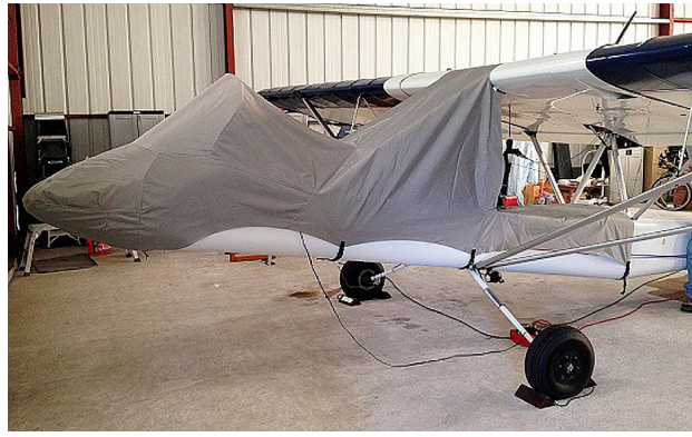
Lockwood AirCam Lightweight Travel Canopy/Nose Cover w/ aft baggage compartment ext