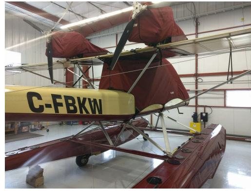
Lockwood Air Cam Canopy Cover, enclosed cockpit style, & Engine Covers