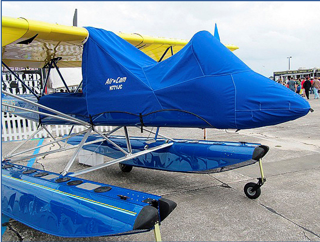
Lockwood AirCam Canopy/Nose Cover w/ aft baggage compartment extension