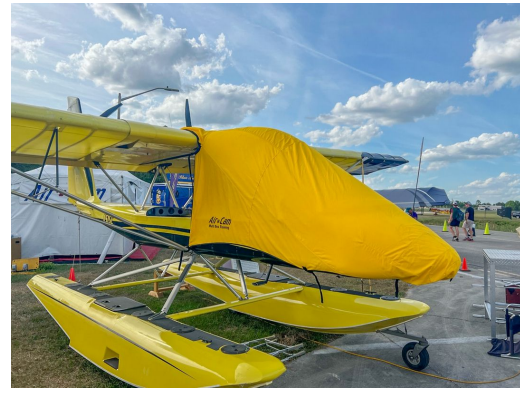
Lockwood Air Cam Canopy/Nose Cover, enclosed canopy, abbreviated.