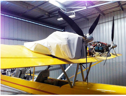
Lockwood AirCam Engine Cover (test fit cover)