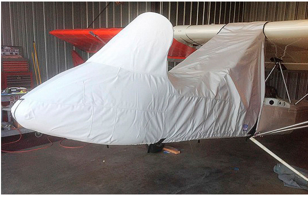
Lockwood AirCam Canopy/Nose Cover