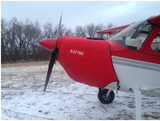
Bellanca Citabria Insulated Engine Cover