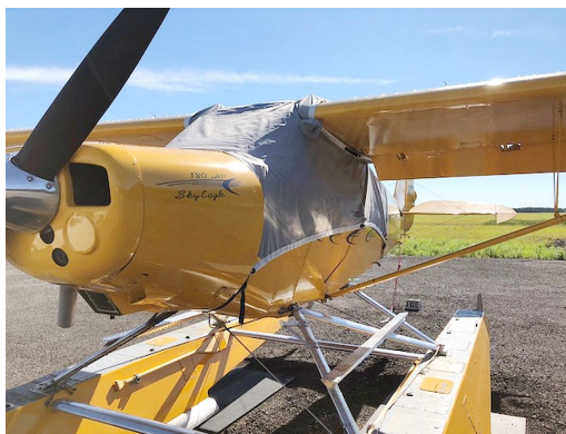
Sportsman 2+2 Wag Aero Light Weight Over the Top Travel Canopy Cover