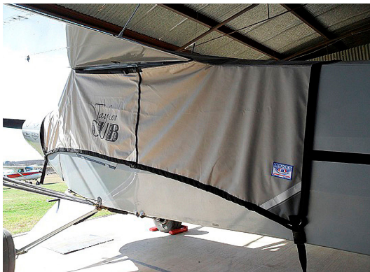
Legend Cub Texas Sport Canopy Cover

This cover type is made from Silver Acrylic Sunbrella canvas and is 100% lined with a soft and smooth microfiber. Bruce's Custom Covers developed this material combination especially for aircraft protection. The outer material is medium weight and treated for water resistance, UV resistance and anti-static buildup. The inner lining is a very soft and smooth microfiber to prevent scratching. The material is very reflective, and tests show that the cabin interior temperature can be reduced to near-ambient temperature on the hottest of days. It is water, ice and snow repellent, yet breathable to allow moisture to escape from between the cover and the aircraft surface.