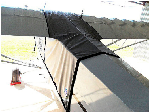
Legend Cub Texas Sport Canopy Cover