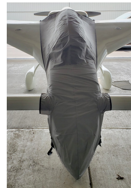
Rutan Long-EZ & Berkut Travel Cover, Light Weight Canopy/Nose Cover