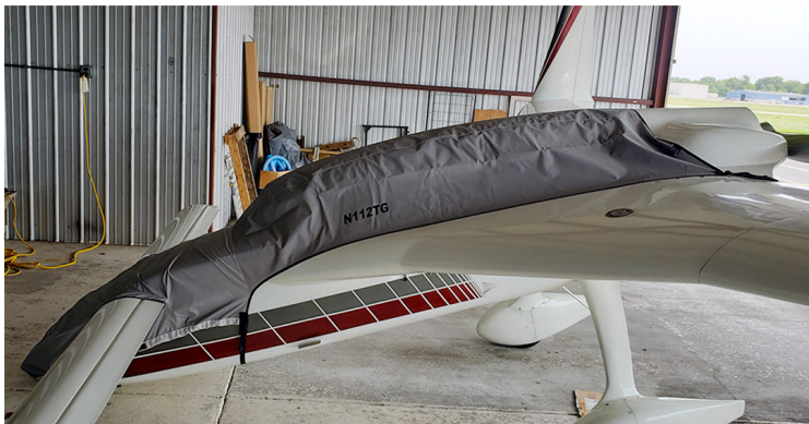
Rutan Long-EZ & Berkut Travel Cover, Light Weight Canopy/Nose Cover

Travel Covers are made with Silver Solution-Dyed Polyester fabric and only lined over the windshield to save weight. The material is lightweight and more compact for easy stowage in the aircraft. The polyester material is water resistant, but only intended for occasional use outside. We also have an ultra lightweight material available for fitted hangar dust covers. For daily outdoor use, the non-travel Sunbrella Cover is the best choice.