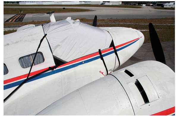
Beech 18 Cockpit Cover