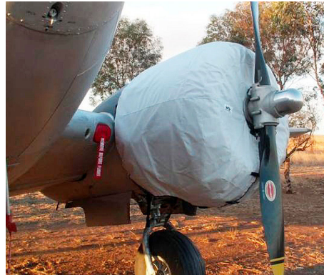
Beech D-18 Engine Covers, Center Section Oil Cooler Inlet Plugs, and Pitot Covers

This cover type is made from Silver Acrylic Sunbrella canvas and is 100% lined with a soft and smooth microfiber. Bruce's Custom Covers developed this material combination especially for aircraft protection. The outer material is medium weight and treated for water resistance, UV resistance and anti-static buildup. The inner lining is a very soft and smooth microfiber to prevent scratching. The material is very reflective, and tests show that the cabin interior temperature can be reduced to near-ambient temperature on the hottest of days. It is water, ice and snow repellent, yet breathable to allow moisture to escape from between the cover and the aircraft surface.