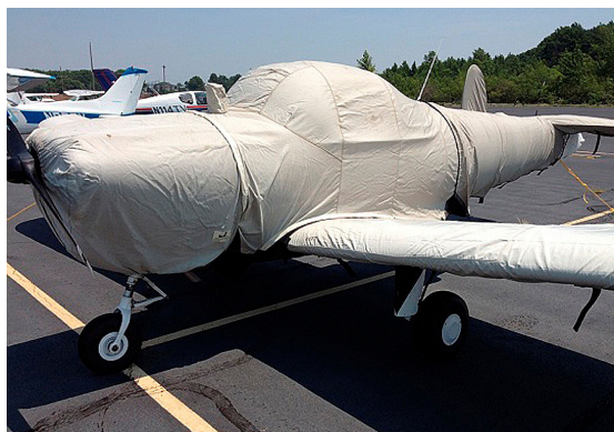
Ercoupe full cover set: Extended Canopy, Engine, Wing & Empennage covers

WINTER USE MATERIAL - Made with Solution-Dyed Polyester fabric, this option is intended for seasonal use to aid in deicing, rain mitigation, or for occasional travel. The material is lighter and more compact, but more susceptible to UV damage and may have a shorter useful life if used continuously outside than the all-year use material.