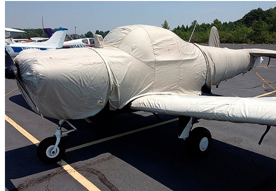
Ercoupe full cover set: Extended Canopy, Engine, Wing & Empennage covers