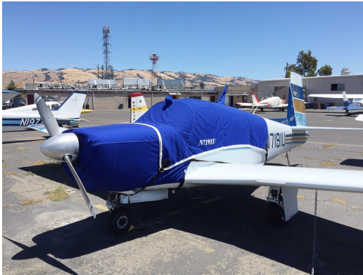
Mooney M20 Canopy & Engine Cover

This cover type is made from Silver Acrylic Sunbrella canvas and is 100% lined with a soft and smooth microfiber. Bruce's Custom Covers developed this material combination especially for aircraft protection. The outer material is medium weight and treated for water resistance, UV resistance and anti-static buildup. The inner lining is a very soft and smooth microfiber to prevent scratching. The material is very reflective, and tests show that the cabin interior temperature can be reduced to near-ambient temperature on the hottest of days. It is water, ice and snow repellent, yet breathable to allow moisture to escape from between the cover and the aircraft surface.