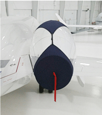
Challenger 300 Intake/Exhaust Cover Set, 3-strap type