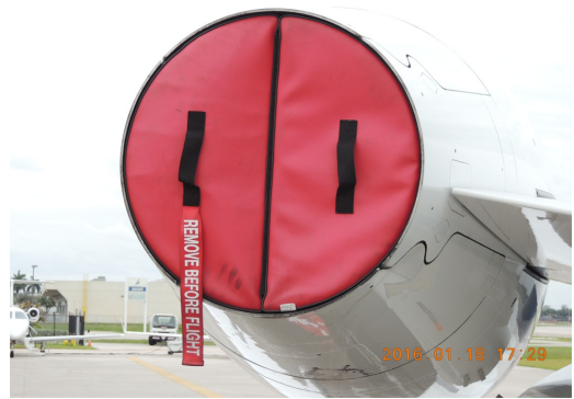
Embraer Legacy 500 Engine Exhaust Plug, folding type