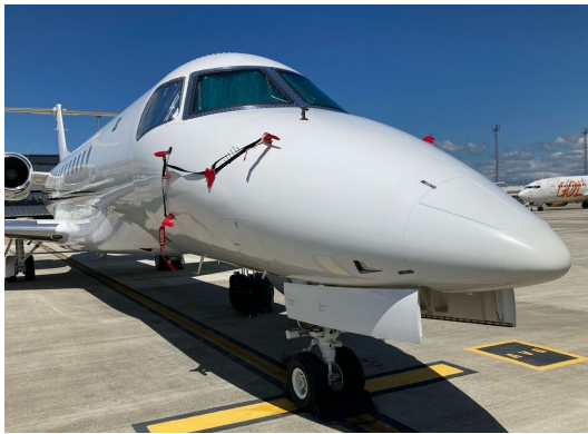
Embraer ERJ-135 Pitot/TAT/Ice Detector Covers

The Engine Inlet Plugs are custom fit for your Embraer ERJ-135/140/145 Legacy 600, 650 intakes, made with heavy-duty vinyl material, and stuffed with a single block of sculpted urethane foam. Each plug has a zipper that allows the foam to be removed and dried if necessary. Engine plugs have 'remove before flight' streamers sewn onto the face of the plugs. Most plugs are imprinted with the aircraft registration number in black for an extra charge. Storage bag NOT included. Engine plugs may be inserted after flight when the engine is still warm. Engine Inlet Plugs are commonly referred to as Cowl Plugs, Intake Plugs, Cowl Blocks, Engine Blocks, and Engine Bungs.