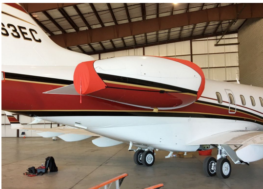
Canadair Challenger 300 Intake/Exhaust Covers, 3-Strap Type

The Embraer ERJ-135/140/145 Legacy 600, 650 Intake Covers are designed to install easily yet be completely storable. A spring steel hoop is sewn into the hem of each cover, allowing them to be installed without climbing onto the wing or using a stepladder. To store the covers the spring steel hoop folds like a band-saw blade into three nesting rings. Each cover folds into a compact circular bundle which is stored in the included duffle bag, yet they unfold quickly for use. The Tri-Fold Ring cover is made of medium weight nylon which is available in a variety of colors to match the paint trim. Each cover set comes complete with installation and folding instructions. The aircraft's registration number can be silkscreened onto the cover for an extra charge.