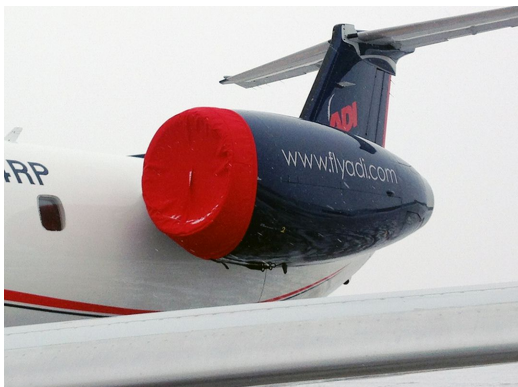
Embraer Legacy 650 Intake Covers

The Embraer ERJ-135/140/145 Legacy 600, 650 Intake Covers are designed to install easily yet be completely storable. A spring steel hoop is sewn into the hem of each cover, allowing them to be installed without climbing onto the wing or using a stepladder. To store the covers the spring steel hoop folds like a band-saw blade into three nesting rings. Each cover folds into a compact circular bundle which is stored in the included duffle bag, yet they unfold quickly for use. The Tri-Fold Ring cover is made of medium weight nylon which is available in a variety of colors to match the paint trim. Each cover set comes complete with installation and folding instructions. The aircraft's registration number can be silkscreened onto the cover for an extra charge.