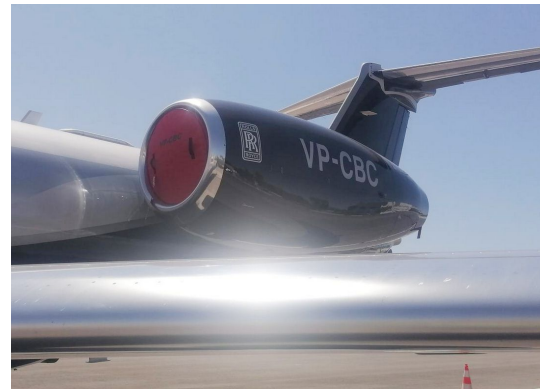
Embraer 135 Engine Inlet Plugs