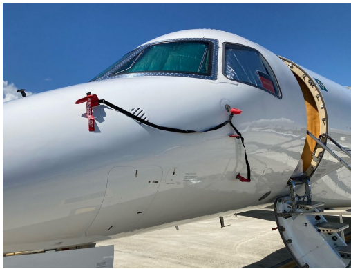
Embraer ERJ-135 Pitot/TAT/Ice Detector Covers

The Engine Inlet Plugs are custom fit for your Embraer ERJ-135/140/145 Legacy 600, 650 intakes, made with heavy-duty vinyl material, and stuffed with a single block of sculpted urethane foam. Each plug has a zipper that allows the foam to be removed and dried if necessary. Engine plugs have 'remove before flight' streamers sewn onto the face of the plugs. Most plugs are imprinted with the aircraft registration number in black for an extra charge. Storage bag NOT included. Engine plugs may be inserted after flight when the engine is still warm. Engine Inlet Plugs are commonly referred to as Cowl Plugs, Intake Plugs, Cowl Blocks, Engine Blocks, and Engine Bungs.