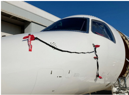
Embraer ERJ-135 Pitot/TAT/Ice Detector Covers

The Engine Inlet Plugs are custom fit for your Embraer ERJ-135/140/145 Legacy 600, 650 intakes, made with heavy-duty vinyl material, and stuffed with a single block of sculpted urethane foam. Each plug has a zipper that allows the foam to be removed and dried if necessary. Engine plugs have 'remove before flight' streamers sewn onto the face of the plugs. Most plugs are imprinted with the aircraft registration number in black for an extra charge. Storage bag NOT included. Engine plugs may be inserted after flight when the engine is still warm. Engine Inlet Plugs are commonly referred to as Cowl Plugs, Intake Plugs, Cowl Blocks, Engine Blocks, and Engine Bungs.