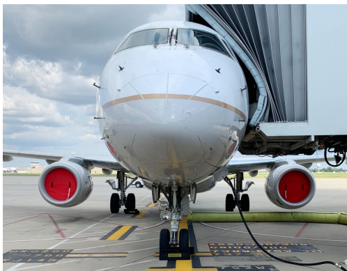
Embraer EMB-170/175 Engine Inlet Plugs

The Engine Inlet Plugs are custom fit for your Embraer EMB-170/175 intakes, made with heavy-duty vinyl material, and stuffed with a single block of sculpted urethane foam. Each plug has a zipper that allows the foam to be removed and dried if necessary. Engine plugs have 'remove before flight' streamers sewn onto the face of the plugs. Most plugs are imprinted with the aircraft registration number in black for an extra charge. Storage bag NOT included. Engine plugs may be inserted after flight when the engine is still warm. Engine Inlet Plugs are commonly referred to as Cowl Plugs, Intake Plugs, Cowl Blocks, Engine Blocks, and Engine Bungs.