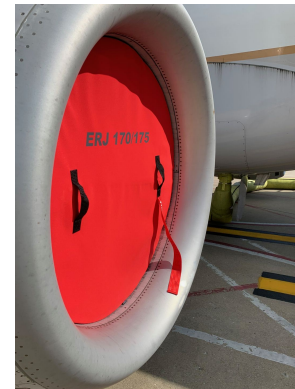
Embraer EMB-170/175 Engine Inlet Plugs