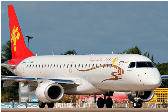
Covers, Plugs & HeatShields for Embraer 170/175/190/195

The Engine Inlet Plugs are custom fit for your Embraer EMB-170/175 intakes, made with heavy-duty vinyl material, and stuffed with a single block of sculpted urethane foam. Each plug has a zipper that allows the foam to be removed and dried if necessary. Engine plugs have 'remove before flight' streamers sewn onto the face of the plugs. Most plugs are imprinted with the aircraft registration number in black for an extra charge. Storage bag NOT included. Engine plugs may be inserted after flight when the engine is still warm. Engine Inlet Plugs are commonly referred to as Cowl Plugs, Intake Plugs, Cowl Blocks, Engine Blocks, and Engine Bungs.