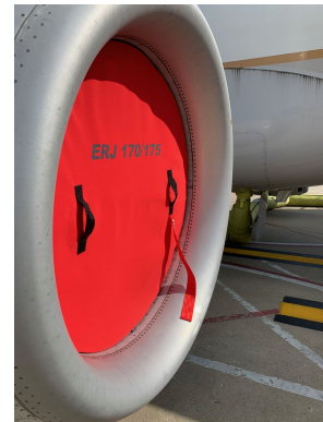
Embraer EMB-170/175 Engine Inlet Plugs