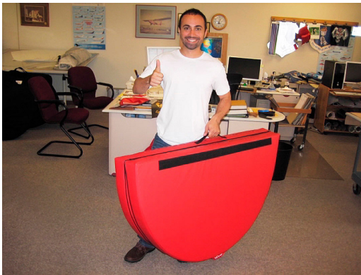
Boeing 737 FOD protection Intake Plug, folding type

The Engine Inlet Plugs are custom fit for your Embraer EMB-170/175 intakes, made with heavy-duty vinyl material, and stuffed with a single block of sculpted urethane foam. Each plug has a zipper that allows the foam to be removed and dried if necessary. Engine plugs have 'remove before flight' streamers sewn onto the face of the plugs. Most plugs are imprinted with the aircraft registration number in black for an extra charge. Storage bag NOT included. Engine plugs may be inserted after flight when the engine is still warm. Engine Inlet Plugs are commonly referred to as Cowl Plugs, Intake Plugs, Cowl Blocks, Engine Blocks, and Engine Bungs.