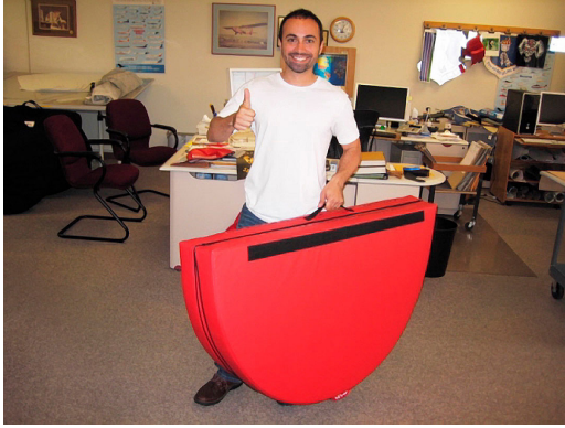
Boeing 737 FOD protection Intake Plug, folding type

ALL-YEAR USE MATERIAL - Made with Silver Acrylic Sunbrella canvas, the all-year use material is the best option for sun protection and cover longevity. This heavier more durable material is intended for all weather conditions, such as rain and snow or lots of sun.