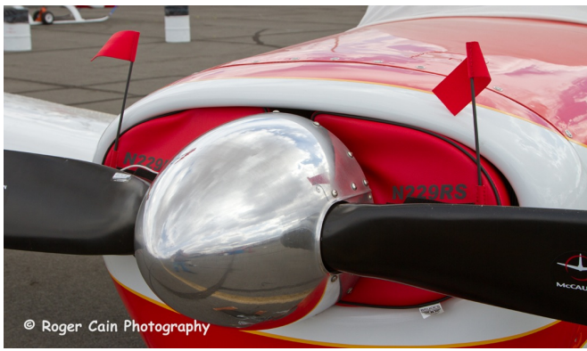
Meyer (Aero Commander) 200 Engine Plugs