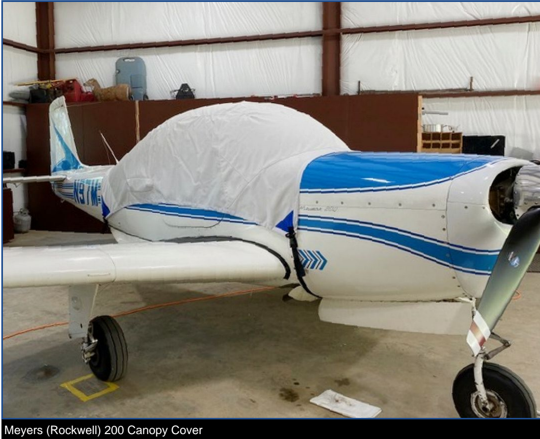
Meyers (Rockwell) 200 Canopy Cover