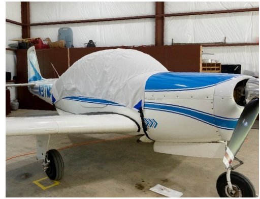
Meyers (Rockwell) 200 Canopy Cover