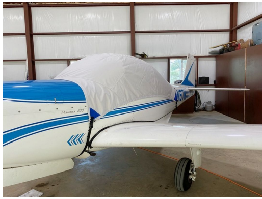
Meyers (Rockwell) 200 Canopy Cover