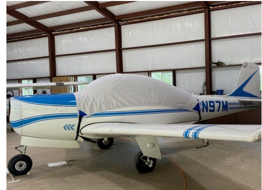
Meyers (Rockwell) 200 Canopy Cover