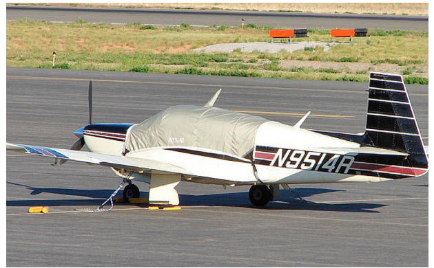
Mooney 201 Canopy Cover