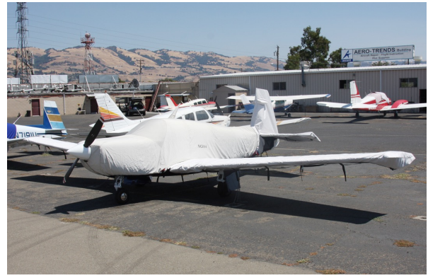
Mooney 231 Full Cover Set