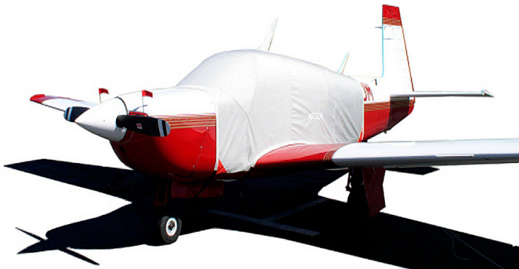
Mooney M20 Extended Canopy Cover & Engine Plugs

This cover type is made from Silver Acrylic Sunbrella canvas and is 100% lined with a soft and smooth microfiber. Bruce's Custom Covers developed this material combination especially for aircraft protection. The outer material is medium weight and treated for water resistance, UV resistance and anti-static buildup. The inner lining is a very soft and smooth microfiber to prevent scratching. The material is very reflective, and tests show that the cabin interior temperature can be reduced to near-ambient temperature on the hottest of days. It is water, ice and snow repellent, yet breathable to allow moisture to escape from between the cover and the aircraft surface.