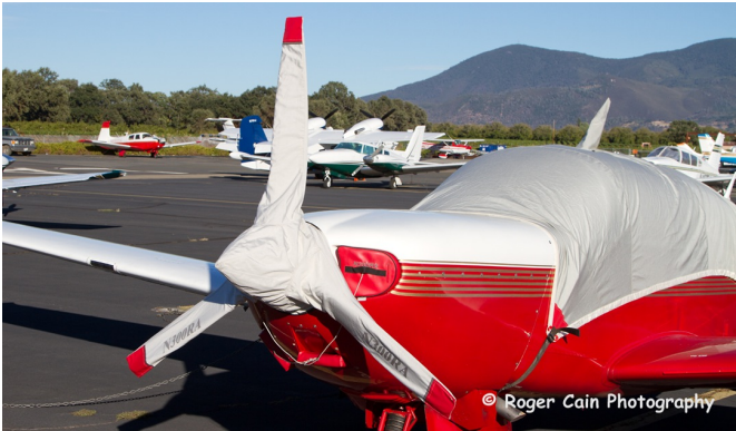
Mooney M20M Bravo 3-Blade Prop Cover, Engine Plugs

Engine Inlet Plugs are custom fit for your Mooney Mustang intakes, made with heavy-duty vinyl material, and stuffed with a single block of sculpted urethane foam. Each plug has a zipper that allows the foam to be removed and dried if necessary. Engine plugs have warning flags that are visible from the cockpit or 'remove before flight' streamers sewn onto the face of the plugs. Most plugs are imprinted with the aircraft registration number in black for an extra charge. Storage bag NOT included. Engine plugs may be inserted after flight when the engine is still warm. Engine Inlet Plugs are commonly referred to as Cowl Plugs, Intake Plugs, Cowl Blocks, Engine Blocks, and Engine Bungs.