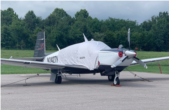
Mooney M20TN Extended Canopy Cover