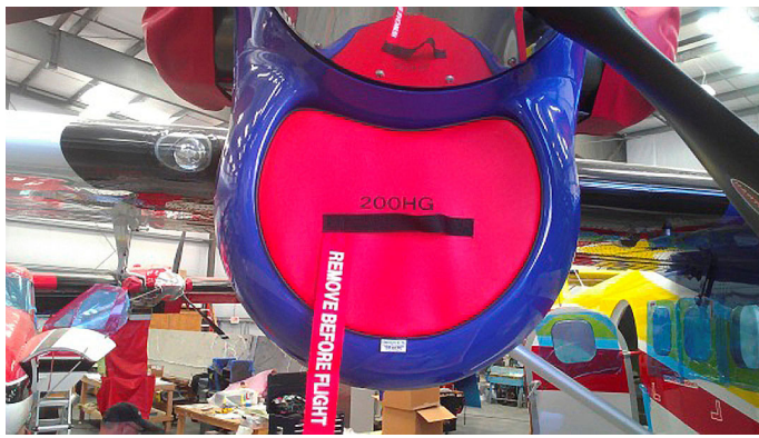
De Havilland Twin Otter Engine Inlet Plug and Exhaust Covers