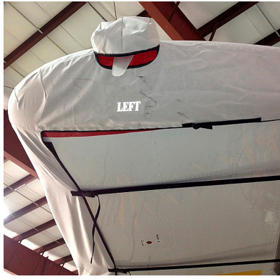
De Havilland Twin Otter Wing Cover wing tip detail

mitigation, or for occasional travel. The material is lighter and more compact, but more susceptible to UV damage and may have a shorter useful life if used continuously outside than the all-year use material.