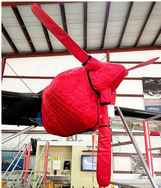
De Havilland Twin Otter Insulated Engine & Insulated Propellor/Spinner Covers