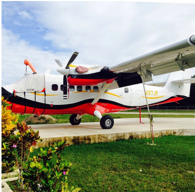
Twin Otter Cockpit Cover & Engine Plugs

This cover type is made from Silver Acrylic Sunbrella canvas and is 100% lined with a soft and smooth microfiber. Bruce's Custom Covers developed this material combination especially for aircraft protection. The outer material is medium weight and treated for water resistance, UV resistance and anti-static buildup. The inner lining is a very soft and smooth microfiber to prevent scratching. The material is very reflective, and tests show that the cabin interior temperature can be reduced to near-ambient temperature on the hottest of days. It is water, ice and snow repellent, yet breathable to allow moisture to escape from between the cover and the aircraft surface.