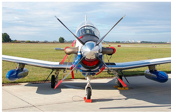
Texan II T6A Engine Inlet Plug, Prop Tie/Exhaust Covers