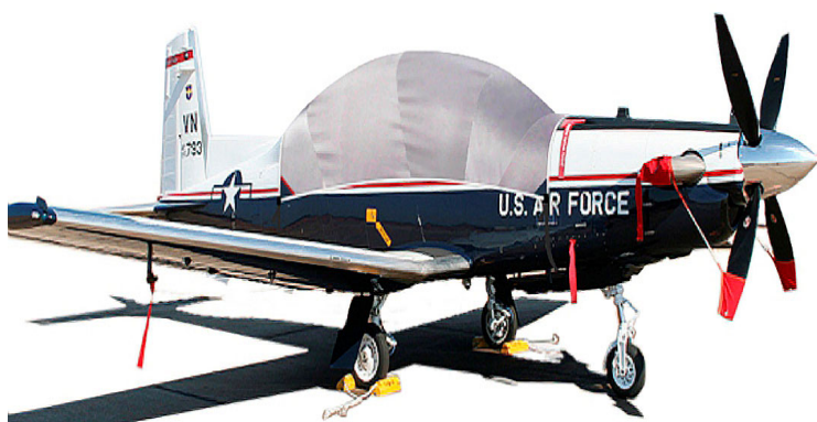
Texan II T6A Canopy Cover, Engine Inlet Plug, Prop Tie/Exhaust Covers, Pitot Cover

Travel Covers are made with Silver Solution-Dyed Polyester fabric and only lined over the windshield to save weight. The material is lightweight and more compact for easy stowage in the aircraft. The polyester material is water resistant, but only intended for occasional use outside. We also have an ultra lightweight material available for fitted hangar dust covers. For daily outdoor use, the non-travel Sunbrella Cover is the best choice.