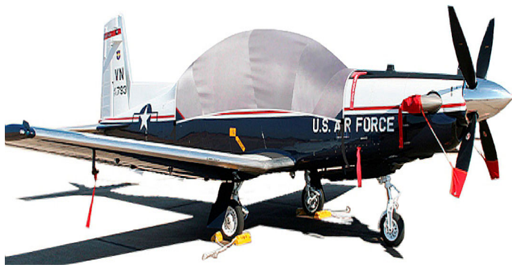
Texan II T6A Canopy Cover, Engine Inlet Plug, Prop Tie/Exhaust Covers, Pitot Cover