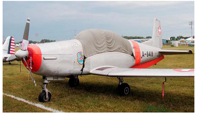
Pilatus P-3 Canopy Cover