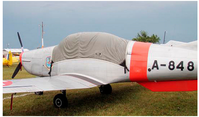
Pilatus P-3 Canopy Cover