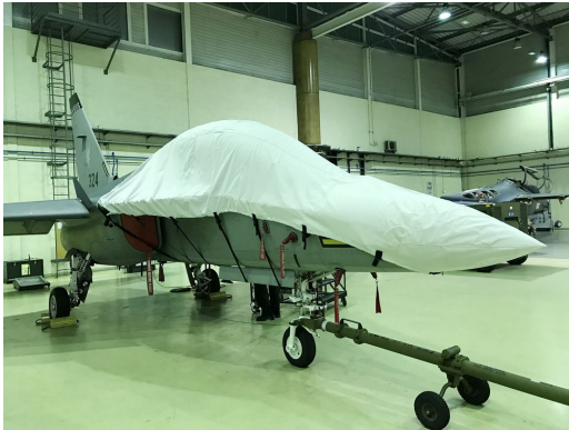
Alenia Aermacchi M-346 Canopy/Nose Cover

This cover type is made from Silver Acrylic Sunbrella canvas and is 100% lined with a soft and smooth microfiber. Bruce's Custom Covers developed this material combination especially for aircraft protection. The outer material is medium weight and treated for water resistance, UV resistance and anti-static buildup. The inner lining is a very soft and smooth microfiber to prevent scratching. The material is very reflective, and tests show that the cabin interior temperature can be reduced to near-ambient temperature on the hottest of days. It is water, ice and snow repellent, yet breathable to allow moisture to escape from between the cover and the aircraft surface.