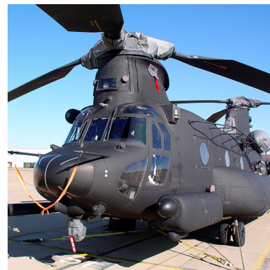
Boeing Vertol MH-47 Rotor Hubs, Engine & Other Covers