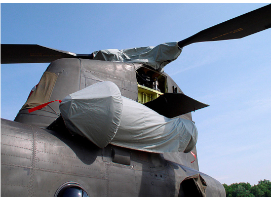
Boeing Vertol CH-47 Engine and Rotor Hub Covers

Insulated Covers Material - A special composite material of solution-dyed polyester, 3M Thinsulate insulation, and soft nylon interior fabric. Our insulated covers are designed to complement an engine preheater and help retain heat in the engine compartment after shutdown. If you operate your aircraft in cold-weather, these covers will help prevent engine wear and tear.