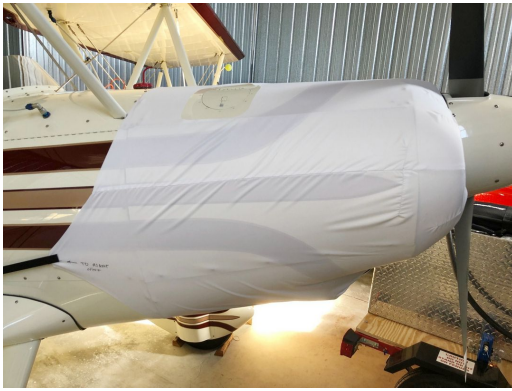
Marquardt Charger Insulated Engine Cover (test fit cover_