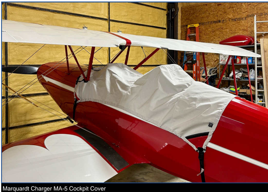
Marquardt Charger MA-5 Cockpit Cover