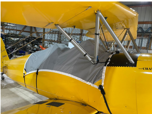
Marquardt Charger Travel Weight Canopy Cover