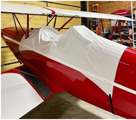
Marquardt Charger MA-5 Cockpit Cover