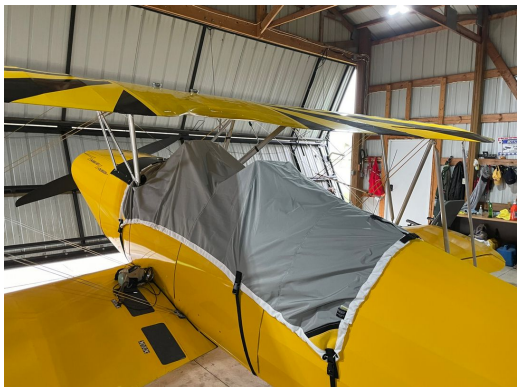
Marquardt Charger Travel Weight Canopy Cover

This cover type is made from Silver Acrylic Sunbrella canvas and is 100% lined with a soft and smooth microfiber. Bruce's Custom Covers developed this material combination especially for aircraft protection. The outer material is medium weight and treated for water resistance, UV resistance and anti-static buildup. The inner lining is a very soft and smooth microfiber to prevent scratching. The material is very reflective, and tests show that the cabin interior temperature can be reduced to near-ambient temperature on the hottest of days. It is water, ice and snow repellent, yet breathable to allow moisture to escape from between the cover and the aircraft surface.