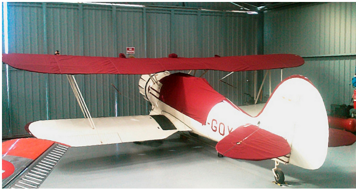
Waco UPF-7 Upper Wing Cover, Horizontal Stabilizer Cover & Canopy Cover

WINTER USE MATERIAL - Made with Solution-Dyed Polyester fabric, this option is intended for seasonal use to aid in deicing, rain mitigation, or for occasional travel. The material is lighter and more compact, but more susceptible to UV damage and may have a shorter useful life if used continuously outside than the all-year use material.