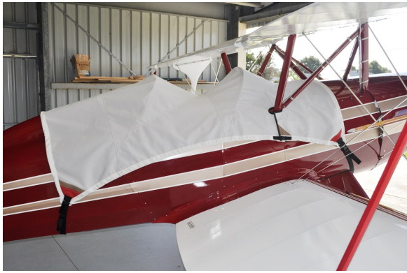
Starduster Too Canopy Cover