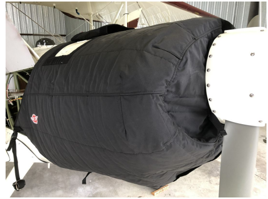
Marquardt Charger MA-5 Insulated Engine Cover