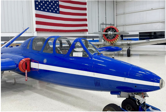
Fougas Magister CM170 Intake Plugs