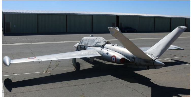
Fouga Magister Canopy/Nose Cover & Tail Stabilizer Covers