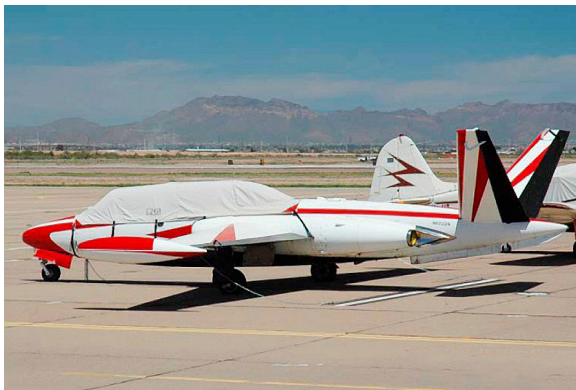
Fouga Magister Canopy Cover

Travel Covers are made with Silver Solution-Dyed Polyester fabric and only lined over the windshield to save weight. The material is lightweight and more compact for easy stowage in the aircraft. The polyester material is water resistant, but only intended for occasional use outside. We also have an ultra lightweight material available for fitted hangar dust covers. For daily outdoor use, the non-travel Sunbrella Cover is the best choice.