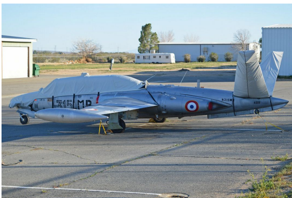
Fougas Magister Canopy/Nose Cover, Tail Stabilizer Covers

WINTER USE MATERIAL - Made with Solution-Dyed Polyester fabric, this option is intended for seasonal use to aid in deicing, rain mitigation, or for occasional travel. The material is lighter and more compact, but more susceptible to UV damage and may have a shorter useful life if used continuously outside than the all-year use material.