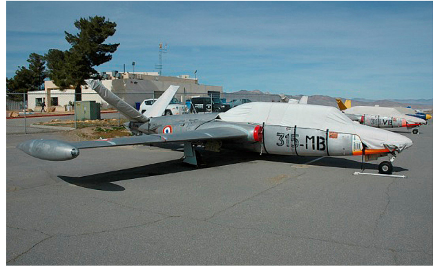
Fouga Magister Canopy/Nose Cover & Tail Stabilizer Covers