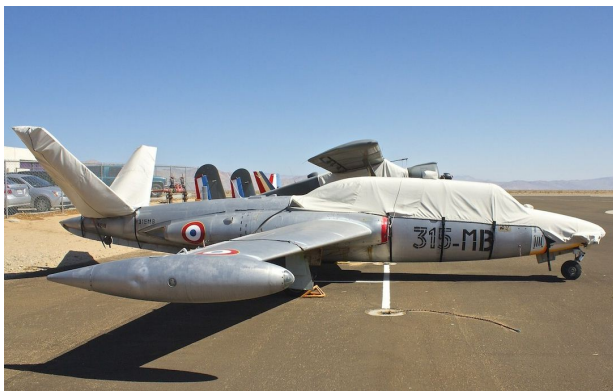
Fouga Magister Canopy/Nose Cover, Tail Stabilizer Covers