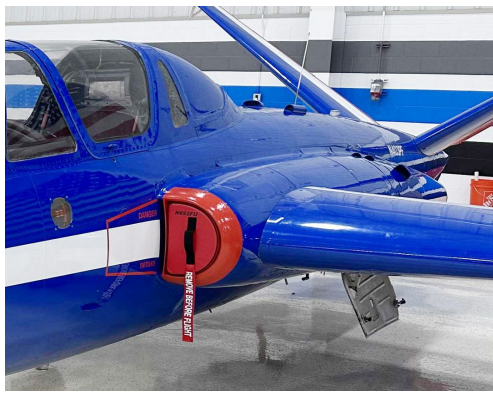
Fougas Magister CM170 Intake Plugs