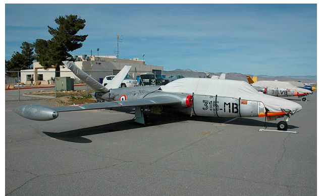
Fougas Magister Canopy/Nose Cover & Tail Stabilizer Covers