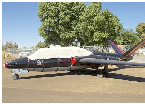
Fougas Magister Canopy Cover, Engine Plugs