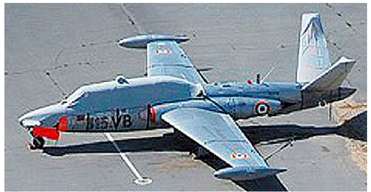
Fouga Magister Canopy/Nose & Stabilizer Covers