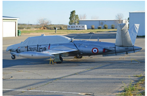
Fouga Magister Canopy/Nose Cover with nose mount loop antenna Fouga Magister Canopy/Nose Cover, Tail Stabilizer Covers