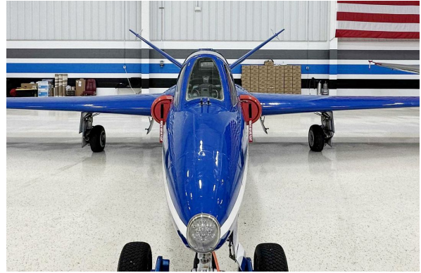
Fouga Magister CM170 Intake Plugs