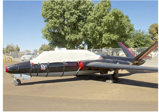
Fougas Magister Canopy Cover, Engine Plugs