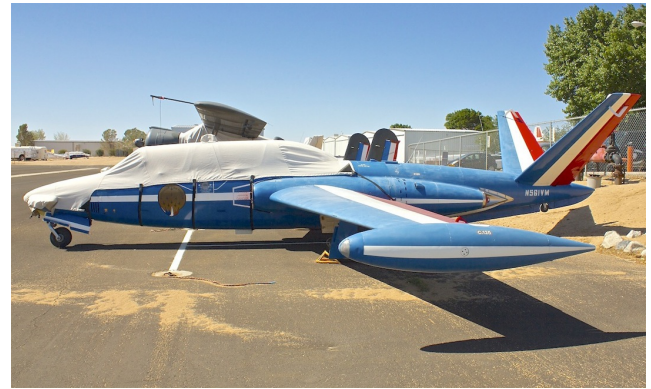
Fouga Magister Canopy/Nose Cover