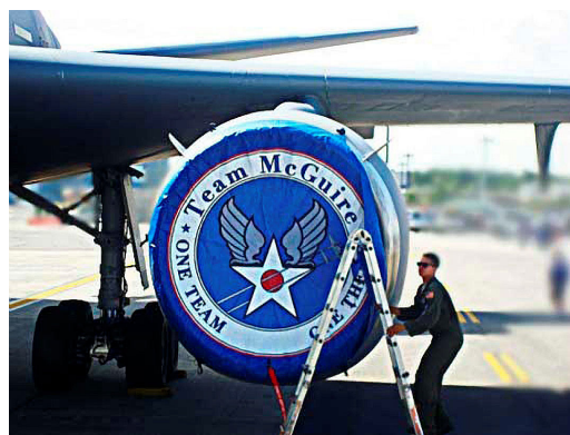
McDonnell Douglas KC-10 Intake Cover