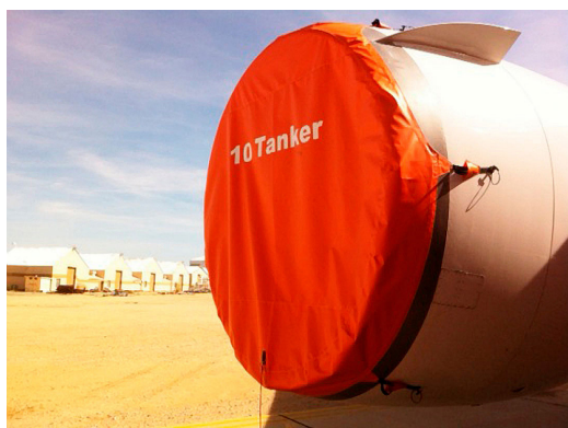
DC-10-30 Intake Cover (CF650C2 Engine)