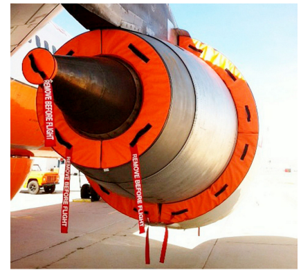
Exhaust Plugs Ship Set, incl. Fan Thrust Reverser and Exhaust Plugs P/N: B767-200 DC-10 Bypass Vent, Exhaust Plug set