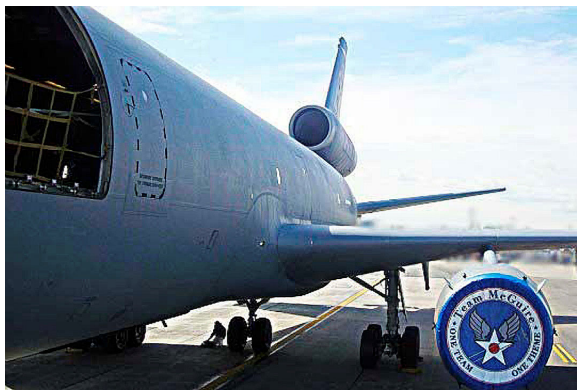
KC-10 Intake Cover at McGuire AFB, NJ