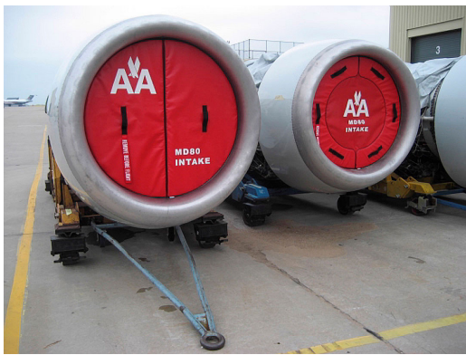
MD-80 JT8D Intake Plugs, Solid Foam folding type& Mesh Center folding type