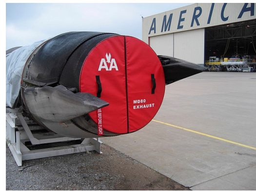
MD80 JT8D Exhaust Plug, Folding Type