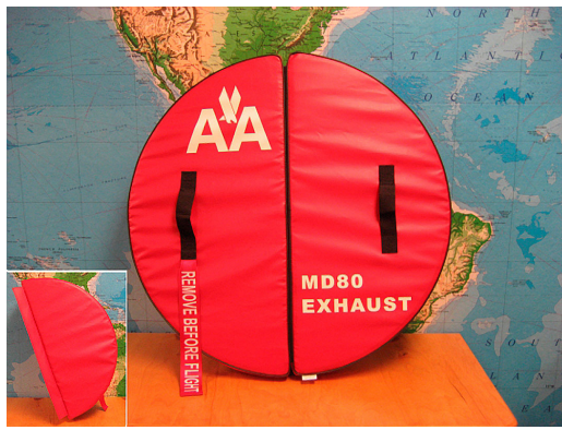
MD-80 Exhaust Plug, folding type