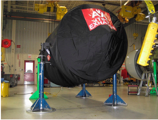
PW JT8D Off-Link Engine Transport Cover (no nose cone, no TR's), fully enclosed

material, and stuffed with a single block of sculpted urethane foam. Each plug has a zipper that allows the foam to be removed and dried if necessary. Engine plugs have 'remove before flight' streamers sewn onto the face of the plugs. Most plugs are imprinted with the aircraft registration number in black for an extra charge. Storage bag NOT included. Engine plugs may be inserted after flight when the engine is still warm. Engine Inlet Plugs are commonly referred to as Cowl Plugs, Intake Plugs, Cowl Blocks, Engine Blocks, and Engine Bungs.