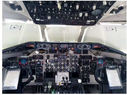
McDonnell Douglas MD80 Cockpit Heatshield Set