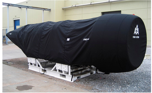
PW JT8D Off-Link Protective Long-term Storage "Rain Cap" Style Engine Cover