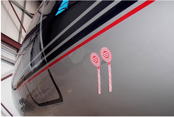
Static Port & Small Inlet/Vent Adhesive Covers: Ideal for Wash Prep and Maintenance

material, and stuffed with a single block of sculpted urethane foam. Each plug has a zipper that allows the foam to be removed and dried if necessary. Engine plugs have 'remove before flight' streamers sewn onto the face of the plugs. Most plugs are imprinted with the aircraft registration number in black for an extra charge. Storage bag NOT included. Engine plugs may be inserted after flight when the engine is still warm. Engine Inlet Plugs are commonly referred to as Cowl Plugs, Intake Plugs, Cowl Blocks, Engine Blocks, and Engine Bungs.