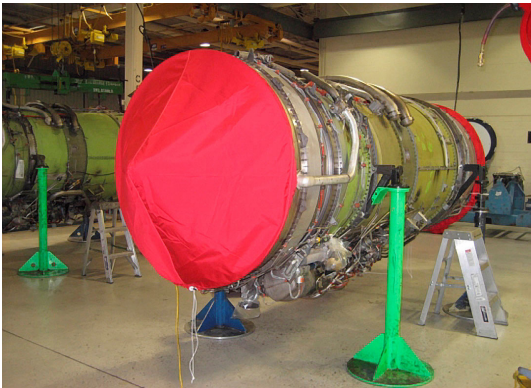
PW JT8D Off-Link Engine Shower Cap Cover Set

material, and stuffed with a single block of sculpted urethane foam. Each plug has a zipper that allows the foam to be removed and dried if necessary. Engine plugs have 'remove before flight' streamers sewn onto the face of the plugs. Most plugs are imprinted with the aircraft registration number in black for an extra charge. Storage bag NOT included. Engine plugs may be inserted after flight when the engine is still warm. Engine Inlet Plugs are commonly referred to as Cowl Plugs, Intake Plugs, Cowl Blocks, Engine Blocks, and Engine Bung.