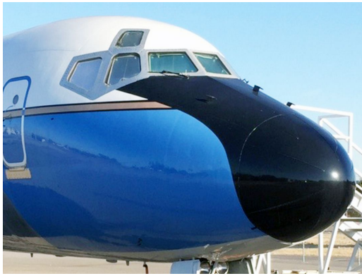
McDonnell Douglas MD80 Cockpit Heatshield Set