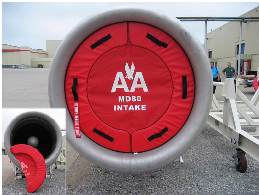
MD-80 JT8D Intake Plug, mesh center & folding type