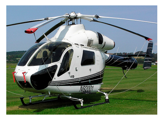
MD900 Blade Tie-downs and Pitot Cover Set