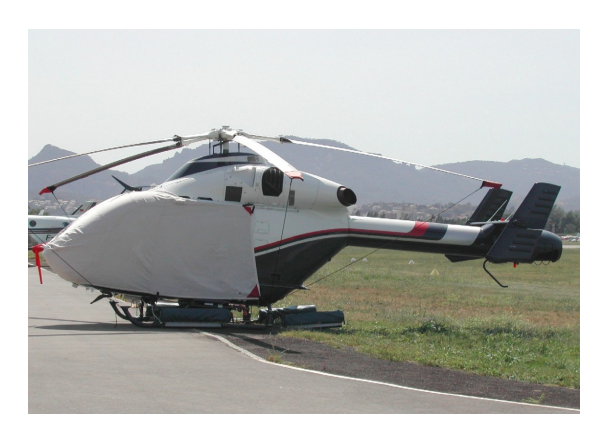
MD900 Bubble Cover

Travel Covers are made with Silver Solution-Dyed Polyester fabric and fully lined over the entire cover. The material is lightweight and more compact for easy stowage in the aircraft. The polyester material is water resistant, but only intended for occasional use outside. We also have an ultra lightweight material available for fitted hangar dust covers. For daily outdoor use, the non-travel Sunbrella Cover is the best choice.