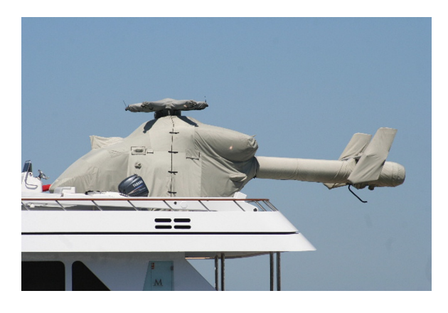
MD900 Complete Cover Set

The Tailboom Cover details vary by model, but generally the helicopter tail boom cover encloses the tail boom from the "bottleneck" to the aft end. They usually also cover the horizontal stabilizers, and are custom made to allow for antennae, lights, and other protrusions. They attach with straps underneath the tail boom. Covers for the vertical and horizontal stabilizers are also available separately. Specific information for each model is available on request.