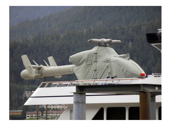
MD900 Full Cover Set