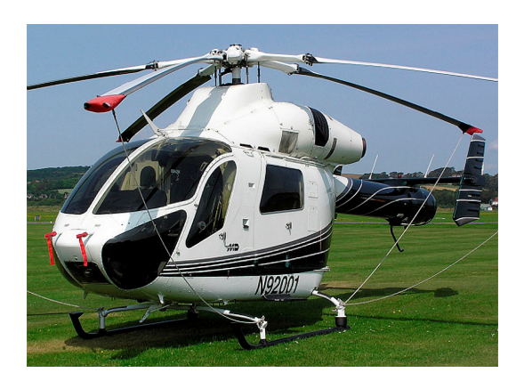
MD900 Blade Tie-downs and Pitot Cover Set