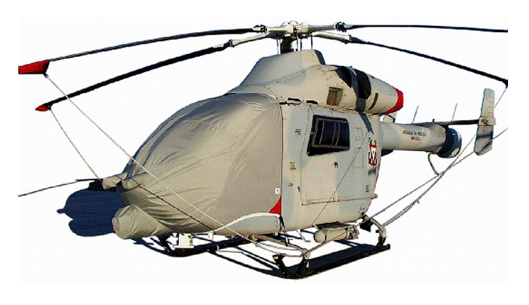
MD900 Forward Bubble Cover (w/Radome), Blade Tie-Downs