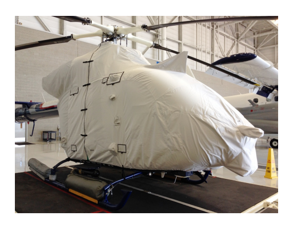
MD900 Main Body Cover