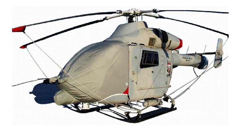
MD900 Forward Bubble Cover (w/Radome), Blade Tie-Downs