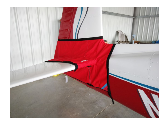
Mooney Tailcone Cover

WINTER USE MATERIAL - Made with Solution-Dyed Polyester fabric, this option is intended for seasonal use to aid in deicing, rain mitigation, or for occasional travel. The material is lighter and more compact, but more susceptible to UV damage and may have a shorter useful life if used continuously outside than the all-year use material.