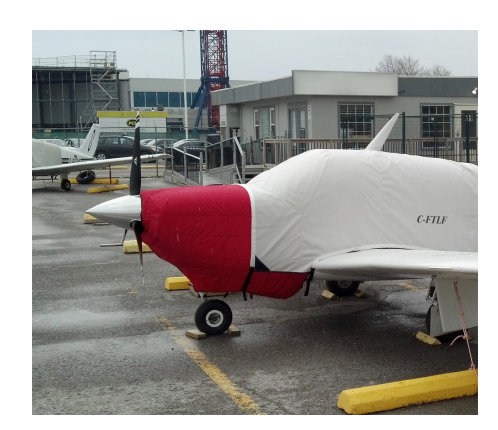
Mooney 201 Insulated Engine Cover, fully enclosed

This cover type is made from Silver Acrylic Sunbrella canvas and is 100% lined with a soft and smooth microfiber. Bruce's Custom Covers developed this material combination especially for aircraft protection. The outer material is medium weight and treated for water resistance, UV resistance and anti-static buildup. The inner lining is a very soft and smooth microfiber to prevent scratching. The material is very reflective, and tests show that the cabin interior temperature can be reduced to near-ambient temperature on the hottest of days. It is water, ice and snow repellent, yet breathable to allow moisture to escape from between the cover and the aircraft surface.