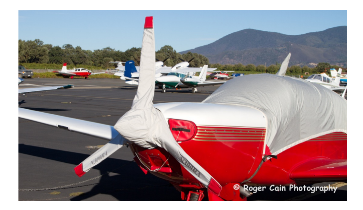
Mooney M20M Bravo 3-Blade Prop Cover, Engine Plugs

Engine Inlet Plugs are custom fit for your Mooney Eagle intakes, made with heavy-duty vinyl material, and stuffed with a single block of sculpted urethane foam. Each plug has a zipper that allows the foam to be removed and dried if necessary. Engine plugs have warning flags that are visible from the cockpit or 'remove before flight' streamers sewn onto the face of the plugs. Most plugs are imprinted with the aircraft registration number in black for an extra charge. Storage bag NOT included. Engine plugs may be inserted after flight when the engine is still warm. Engine Inlet Plugs are commonly referred to as Cowl Plugs, Intake Plugs, Cowl Blocks, Engine Blocks, and Engine Bungs.