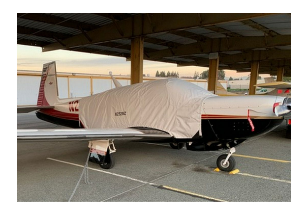
Mooney M20K Extended Canopy Cover