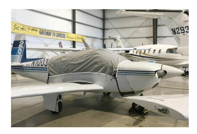
Mooney 201 Travel Cover, Light Weight Travel Canopy Cover, 5 Lbs