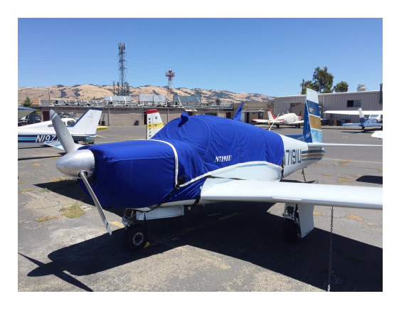
Mooney M20 Canopy & Engine Cover