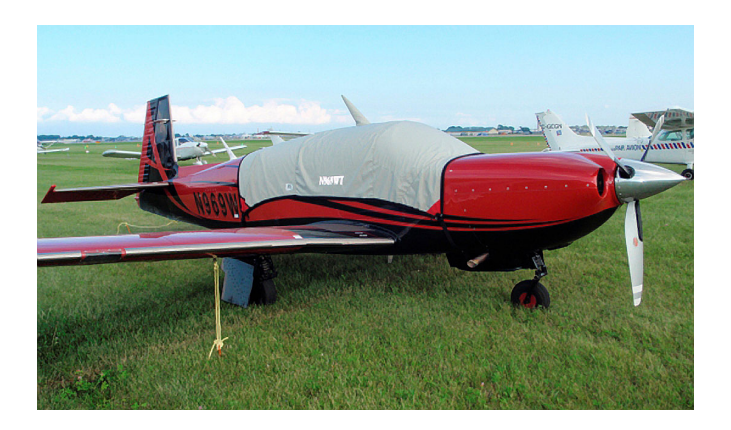
Mooney Acclaim Canopy Cover

This cover type is made from Silver Acrylic Sunbrella canvas and is 100% lined with a soft and smooth microfiber. Bruce's Custom Covers developed this material combination especially for aircraft protection. The outer material is medium weight and treated for water resistance, UV resistance and anti-static buildup. The inner lining is a very soft and smooth microfiber to prevent scratching. The material is very reflective, and tests show that the cabin interior temperature can be reduced to near-ambient temperature on the hottest of days. It is water, ice and snow repellent, yet breathable to allow moisture to escape from between the cover and the aircraft surface.