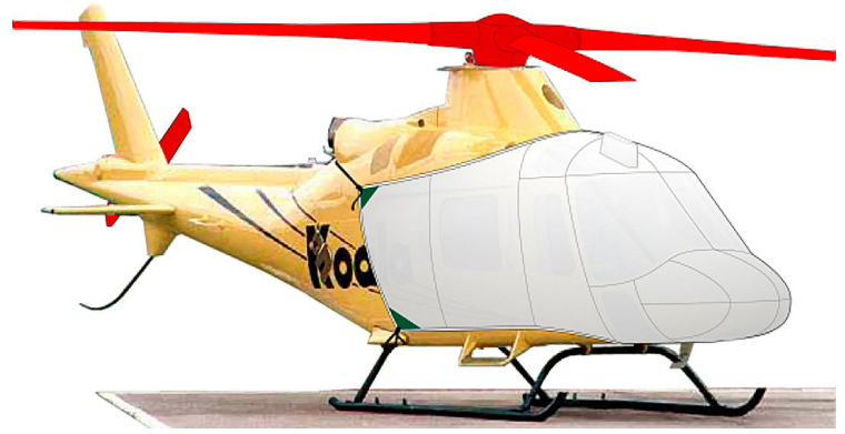
Koala Bubble, Rotor Hub, Blade & Tail Rotor Covers (illustration)