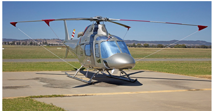
Agusta 119 Cockpit/Cabin HeatShields