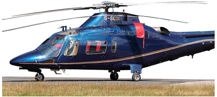
Agusta Power Intake Cover