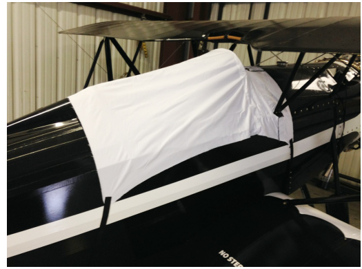
Rose Parrakeet Canopy Cover (test fit cover)