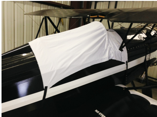
Rose Parrakeet Canopy Cover (test fit cover)

This cover type is made from Silver Acrylic Sunbrella canvas and is 100% lined with a soft and smooth microfiber. Bruce's Custom Covers developed this material combination especially for aircraft protection. The outer material is medium weight and treated for water resistance, UV resistance and anti-static buildup. The inner lining is a very soft and smooth microfiber to prevent scratching. The material is very reflective, and tests show that the cabin interior temperature can be reduced to near-ambient temperature on the hottest of days. It is water, ice and snow repellent, yet breathable to allow moisture to escape from between the cover and the aircraft surface.