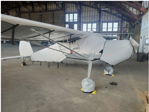
Cessna 140 Canopy, Wings, Prop, Tires & Empennage Covers

WINTER USE MATERIAL - Made with Solution-Dyed Polyester fabric, this option is intended for seasonal use to aid in deicing, rain mitigation, or for occasional travel. The material is lighter and more compact, but more susceptible to UV damage and may have a shorter useful life if used continuously outside than the all-year use material.