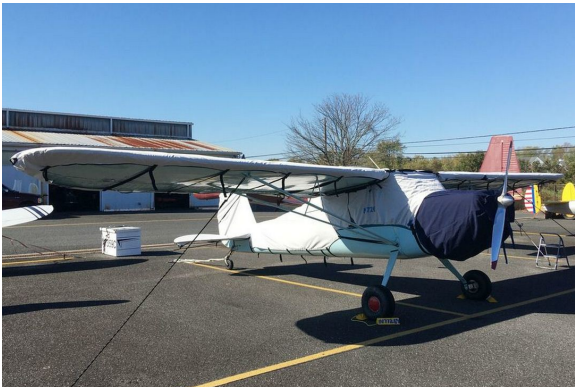
Cessna 140 Insulated Engine, Canopy, Empennage & Wing Covers