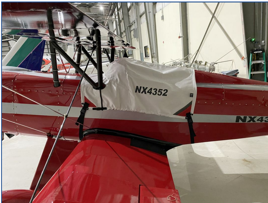
EAA Acro Sport Canopy Cover