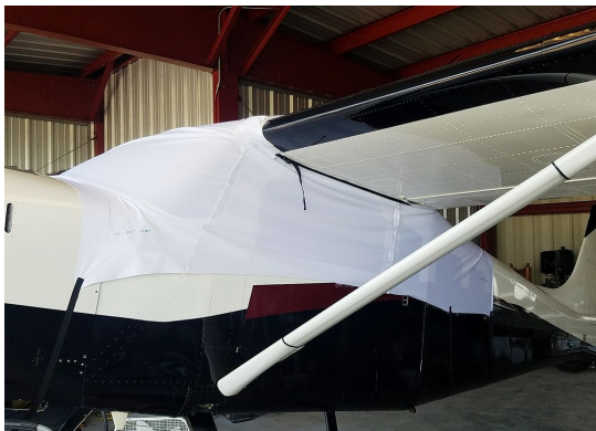
Murphy Moose Canopy Cover (test fit cover)