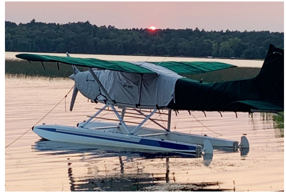
Cessna A185F Complete Cover Set