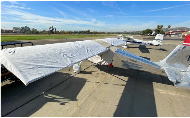
Murphy Elite Wing Covers