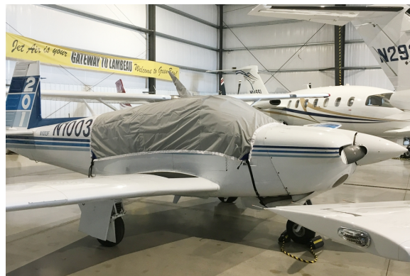
Mooney 201 Travel Cover, Light Weight Travel Canopy Cover, 5 Lbs

Travel Covers are made with Silver Solution-Dyed Polyester fabric and only lined over the windshield to save weight. The material is lightweight and more compact for easy stowage in the aircraft. The polyester material is water resistant, but only intended for occasional use outside. We also have an ultra lightweight material available for fitted hangar dust covers. For daily outdoor use, the non-travel Sunbrella Cover is the best choice.