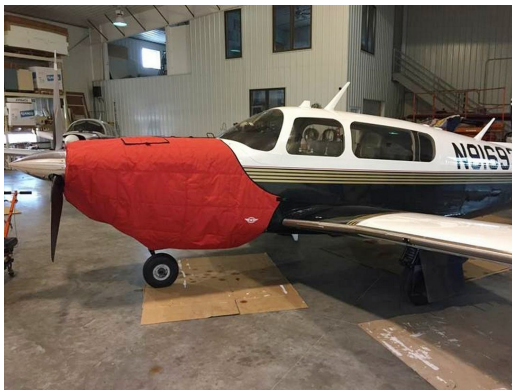
Mooney Ovation Insulated Engine Cover

This cover type is made from Silver Acrylic Sunbrella canvas and is 100% lined with a soft and smooth microfiber. Bruce's Custom Covers developed this material combination especially for aircraft protection. The outer material is medium weight and treated for water resistance, UV resistance and anti-static buildup. The inner lining is a very soft and smooth microfiber to prevent scratching. The material is very reflective, and tests show that the cabin interior temperature can be reduced to near-ambient temperature on the hottest of days. It is water, ice and snow repellent, yet breathable to allow moisture to escape from between the cover and the aircraft surface.