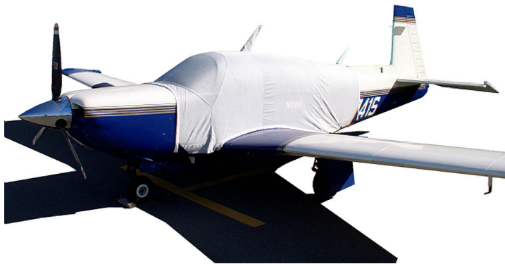
Mooney Extended Canopy Cover

This cover type is made from Silver Acrylic Sunbrella canvas and is 100% lined with a soft and smooth microfiber. Bruce's Custom Covers developed this material combination especially for aircraft protection. The outer material is medium weight and treated for water resistance, UV resistance and anti-static buildup. The inner lining is a very soft and smooth microfiber to prevent scratching. The material is very reflective, and tests show that the cabin interior temperature can be reduced to near-ambient temperature on the hottest of days. It is water, ice and snow repellent, yet breathable to allow moisture to escape from between the cover and the aircraft surface.