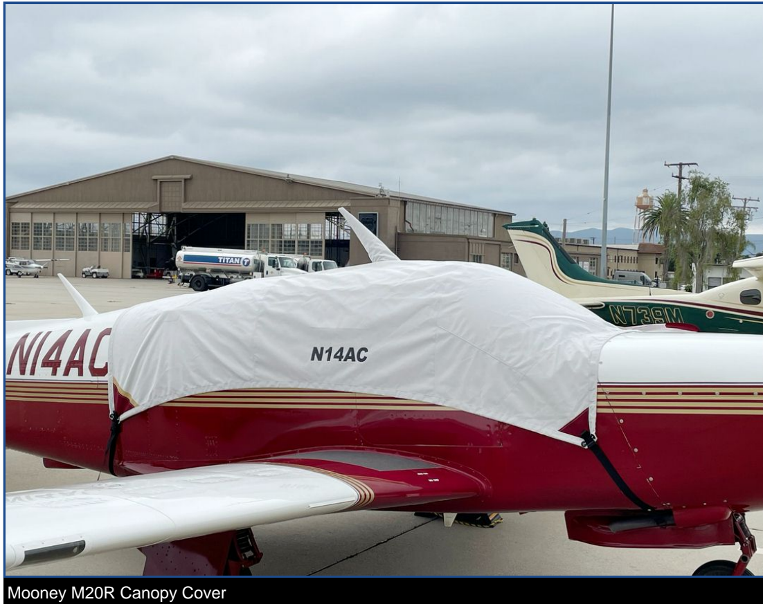
Mooney M20R Canopy Cover