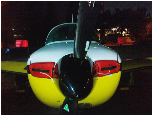
Mooney 231 Engine Inlet Plugs

Engine Inlet Plugs are custom fit for your Mooney Ovation & Ovation Ultra intakes, made with heavy-duty vinyl material, and stuffed with a single block of sculpted urethane foam. Each plug has a zipper that allows the foam to be removed and dried if necessary. Engine plugs have warning flags that are visible from the cockpit or 'remove before flight' streamers sewn onto the face of the plugs. Most plugs are imprinted with the aircraft registration number in black for an extra charge. Storage bag NOT included. Engine plugs may be inserted after flight when the engine is still warm. Engine Inlet Plugs are commonly referred to as Cowl Plugs, Intake Plugs, Cowl Blocks, Engine Blocks, and Engine Bungs.