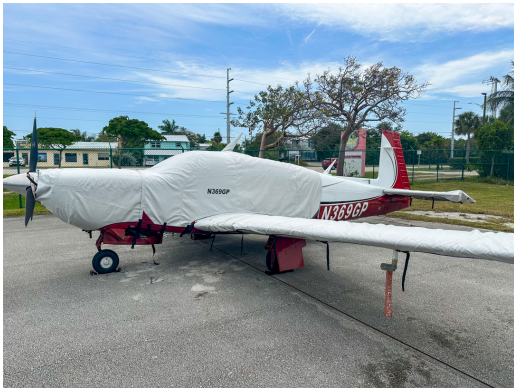
Mooney TLS/Acclaim Fully Enclosed Insulated Engine Cover, 3D model Mooney M20M Extended Canopy, Engine & Wing Covers