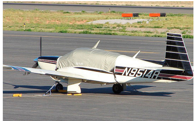
Mooney 201 Canopy Cover