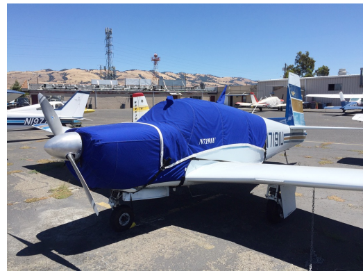
Mooney M20 Canopy & Engine Cover