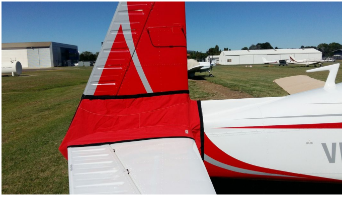
Mooney M20J Tailcone Cover