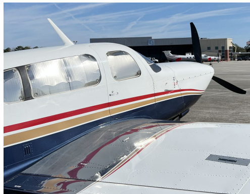
Mooney M20S Heatshield Set

Windshield Heatshields are interior sunshades for an aircraft's front windshield. The product is a unique composite of closed-cell foam with a silver mylar finish. The semi-rigid design is stiff enough to stand along the inside of the windshield using sun visors or window framing. It folds up flat and easily stores in the included storage sleeve. Some designs may require velcro and suction cups or split right and left sides. A Heatshield is an excellent short-term remedy for cockpit overheating. An external fabric cover is far more effective and practical for long-term protection.