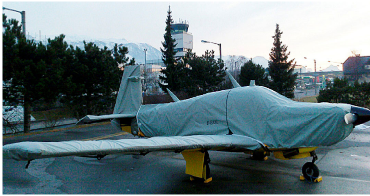
Mooney 231 Extra Extended Canopy/Engine Cover, Wing covers & Empennage Cover