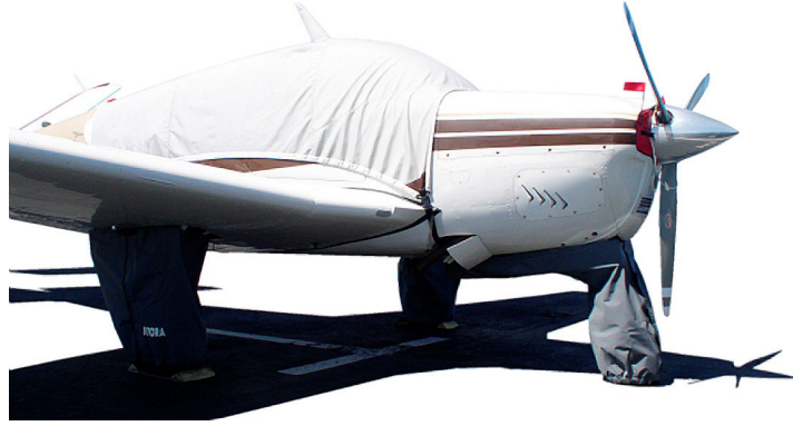
Beech Bonanza/Debonair/Baron Landing Gear Covers