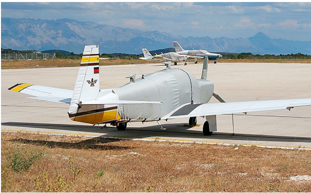
Mooney Extended Canopy/Engine Cover

This cover type is made from Silver Acrylic Sunbrella canvas and is 100% lined with a soft and smooth microfiber. Bruce's Custom Covers developed this material combination especially for aircraft protection. The outer material is medium weight and treated for water resistance, UV resistance and anti-static buildup. The inner lining is a very soft and smooth microfiber to prevent scratching. The material is very reflective, and tests show that the cabin interior temperature can be reduced to near-ambient temperature on the hottest of days. It is water, ice and snow repellent, yet breathable to allow moisture to escape from between the cover and the aircraft surface.