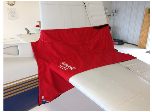
Mooney Tailcone Cover