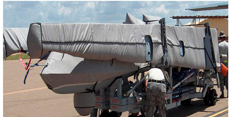
MQ1 Fuselage and Wing Covers