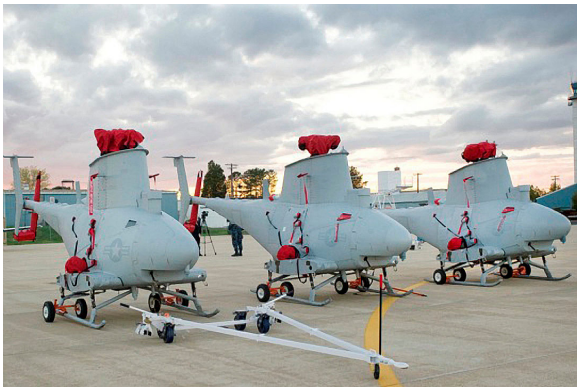
Northrup Grumman MQ-8 Firescout Plugs and Covers