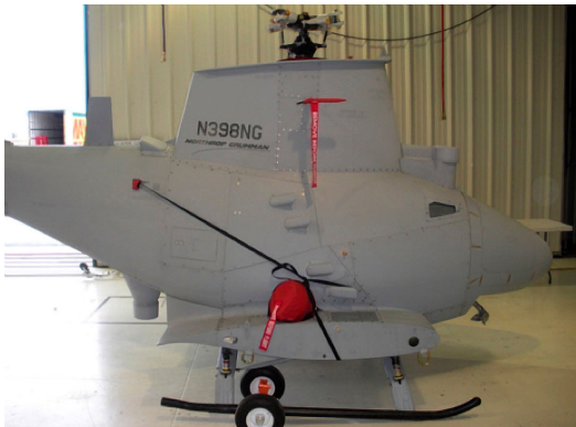
Covers & Plugs for the Northrup Grumman MQ-8 Fire Scout

necessary. Engine plugs have 'Remove Before Flight' streamers sewn onto the face of the plugs. Most plugs are imprinted with the aircraft registration number in black for an extra charge. Storage bag NOT included. Engine plugs may be inserted after flight when the engine is still warm. Engine Inlet Plugs are commonly referred to as Cowl Plugs, Intake Plugs, Cowl Blocks, Engine Blocks, and Engine Bung.