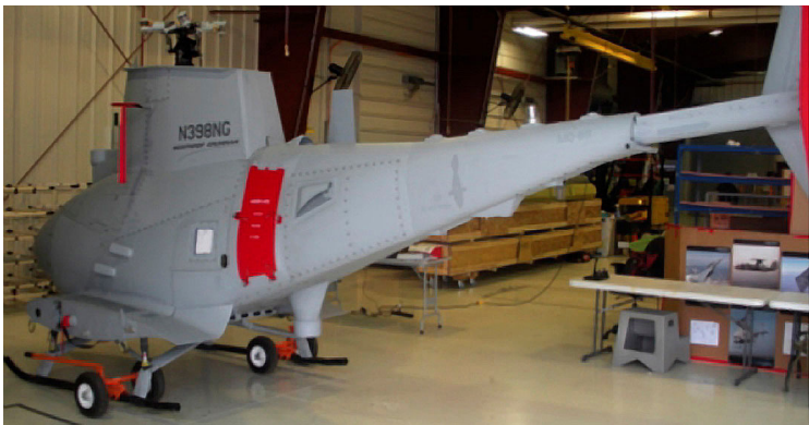
Covers & Plugs for the Northrup Grumman MQ-8 Fire Scout