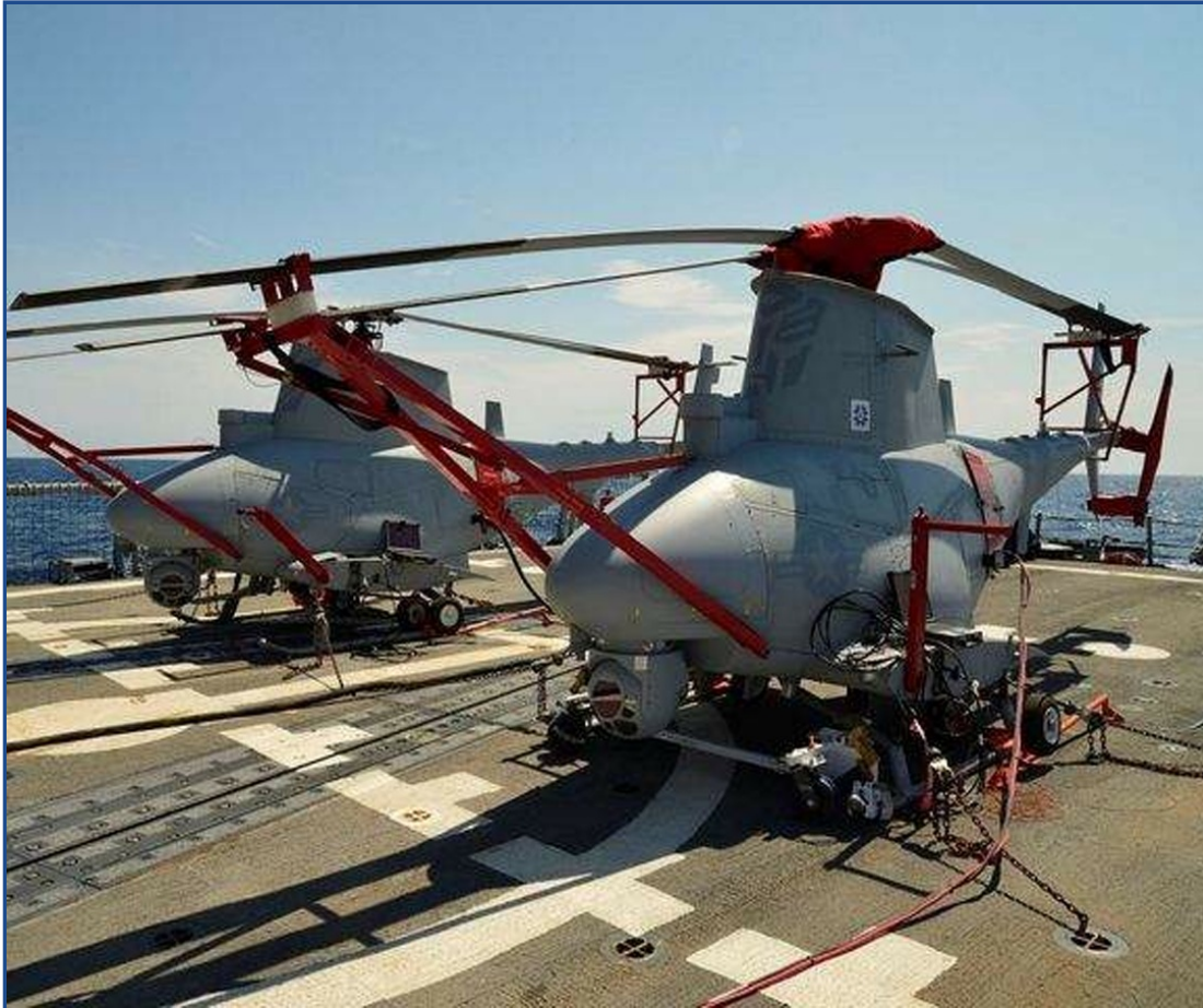
Northrop Grumman MQ-8 Fire Scout Rotor Hub & Tail Rotor Covers