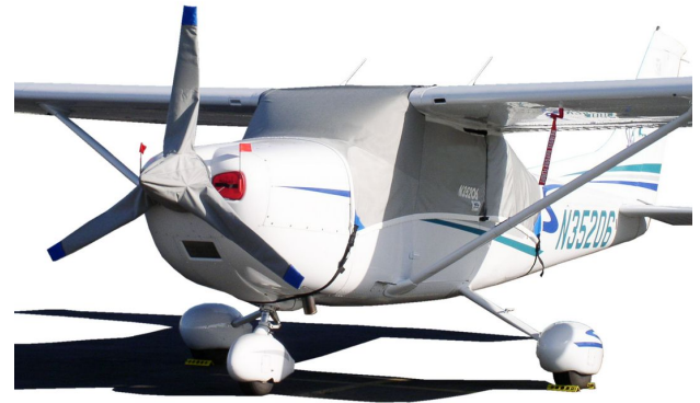
Cessna 182 Canopy Cover, Engine Plugs, 3-Blade Prop Cover