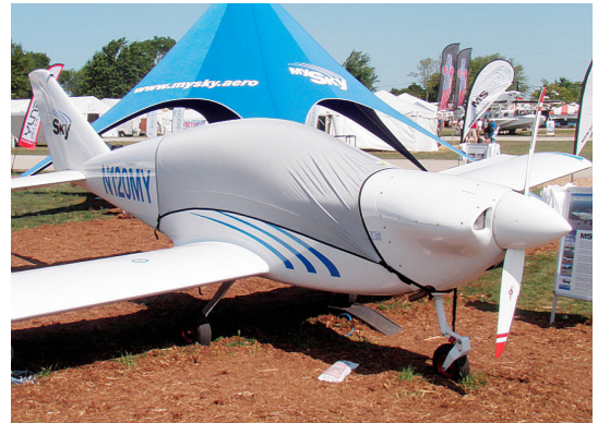
Mysky Fly-Away Travel Cover