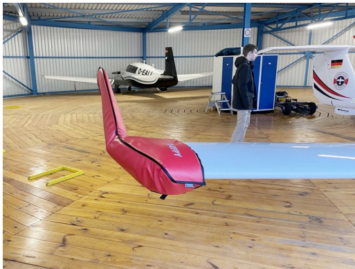
Diamond DA-40 Wingtip Pads

Designed to prevent damage to the aircraft extremities in crowded hangars, these products are made of bright red Naugahyde and thickly padded with a sandwich of closed cell foam.