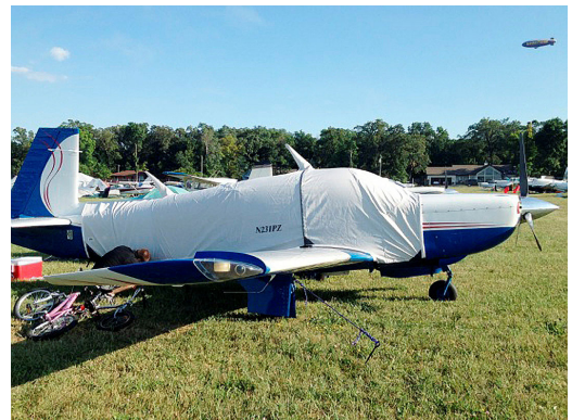
Mooney 231 Extended Canopy Cover