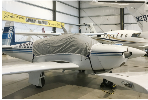
Mooney 201 Travel Cover, Light Weight Travel Canopy Cover, 5 Lbs

occasional use outside. We also have an ultra lightweight material available for fitted hangar dust covers. For daily outdoor use, the non-travel Sunbrella Cover is the best choice.