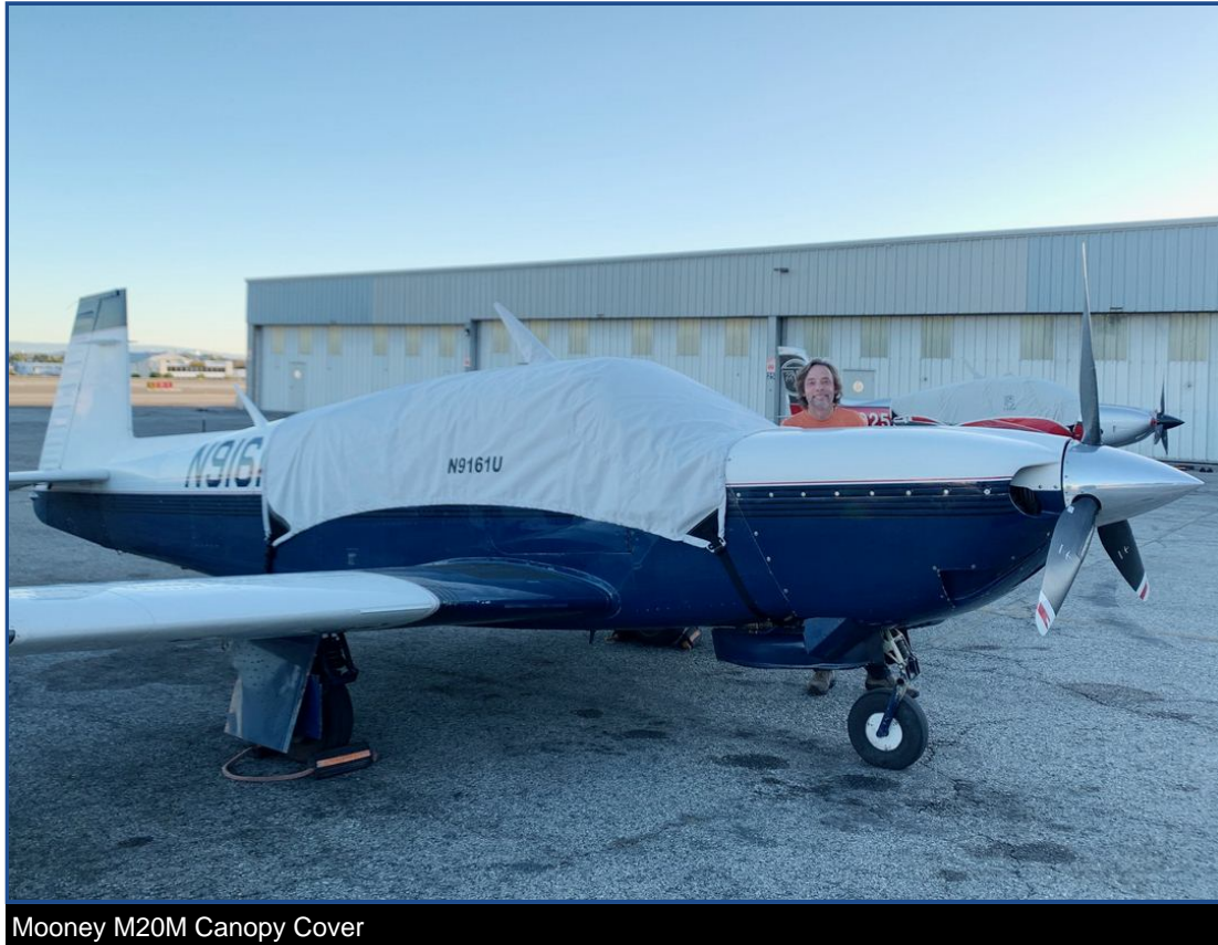
Mooney M20M Canopy Cover