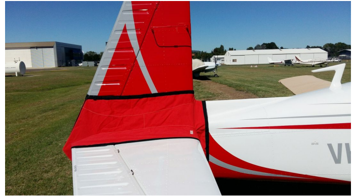
Mooney M20J Tailcone Cover