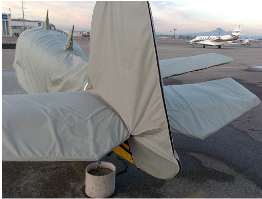
Mooney 231 Full Cover Set: Extra Extended Canopy/Engine Cover, Wing Covers, and Empennage Cover

WINTER USE MATERIAL - Made with Solution-Dyed Polyester fabric, this option is intended for seasonal use to aid in deicing, rain mitigation, or for occasional travel. The material is lighter and more compact, but more susceptible to UV damage and may have a shorter useful life if used continuously outside than the all-year use material.