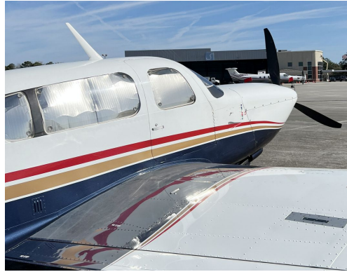
Mooney M20S Heatshield Set

more effective and practical for long-term protection.