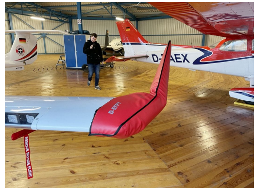
Diamond DA-40 Wingtip Pads