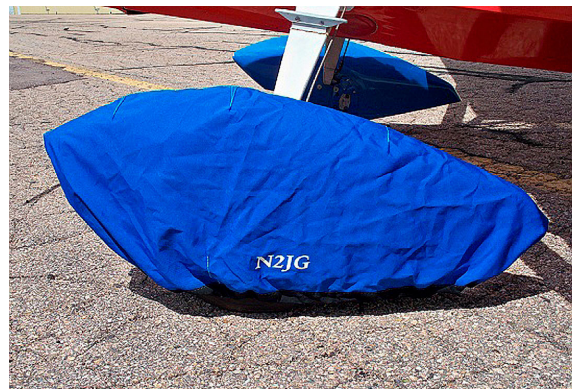
Bellanca Citabria Wheelpant Cover