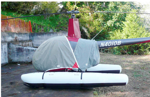
Robinson R-22 Standard Bubble Cover & Engine Cover

Bruce's Autogyro MTO Sport, 2010, 2017 Gyrocopter Blade Covers are made of medium-weight Solution-Dyed Polyester and designed to avoid trim tabs or wicks. You can install Blade Covers from the ground with the aid of a lightweight rope attached to the open end. Covers are cinched tight at the blade root with straps and quick-release plastic buckles. The Cold Weather Blade Covers are fitted with full-length zippers and optional deice "boots" designed to accept a preheater hose; a small opening at the tip of the cover allows for some air circulation and drainage in freezing weather. Some part numbers have features for an extra charge.