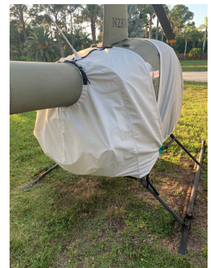
Robinson R-22 Engine Cover