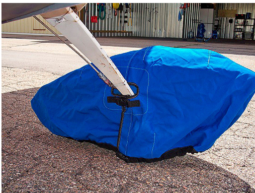
Bellanca Citabria Wheelpant Cover

ALL-YEAR USE MATERIAL - Made with Silver Acrylic Sunbrella canvas, the all-year use material is the best option for sun protection and cover longevity. This heavier more durable material is intended for all weather conditions, such as rain and snow or lots of sun.