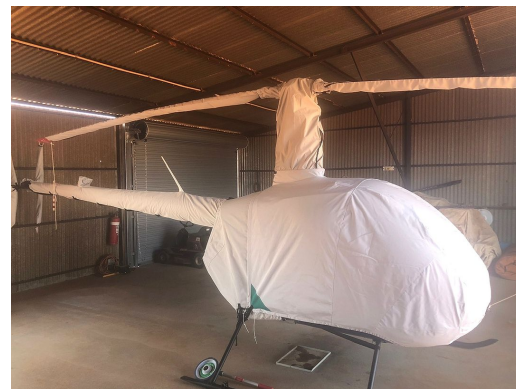
Robinson R-22 Full Cover Set