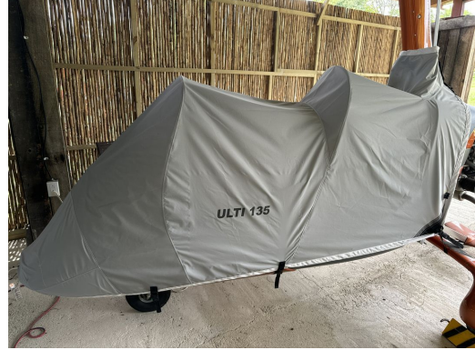
MTO Sport Travel Weight Canopy/Nose Cover