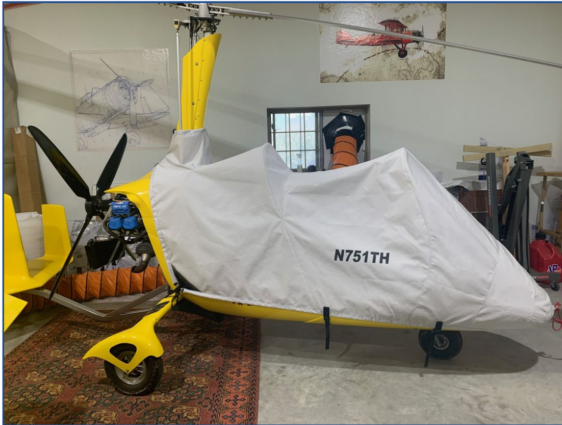
MTO Sport Canopy/Nose Cover