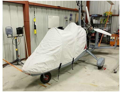
Magni Auto Gyro M16 Cockpit/Nose Cover