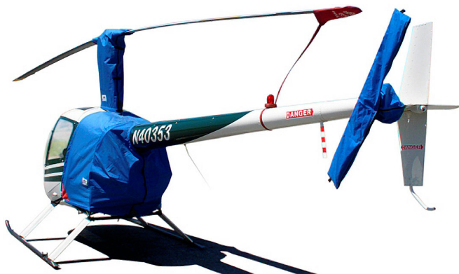
Robinson R-22 Engine, Rotor Mast & Tail Rotor Covers, with Blade Tie-down

Bruce's Autogyro MTO Sport, 2010, 2017 Gyrocopter Blade Covers are made of medium-weight Solution-Dyed Polyester and designed to avoid trim tabs or wicks. You can install Blade Covers from the ground with the aid of a lightweight rope attached to the open end. Covers are cinched tight at the blade root with straps and quick-release plastic buckles. The Cold Weather Blade Covers are fitted with full-length zippers and optional deice "boots" designed to accept a preheater hose; a small opening at the tip of the cover allows for some air circulation and drainage in freezing weather. Some part numbers have features for an extra charge.