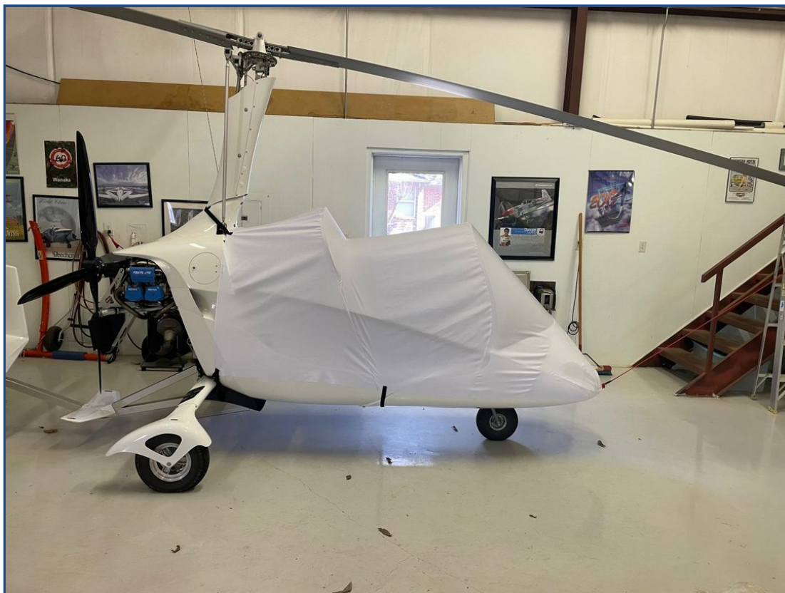
MTO Sport Gyrocopter Canopy/Nose Cover, test fit cover