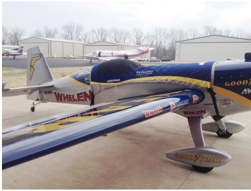
Extra 300SC with NASCAR style custom cover