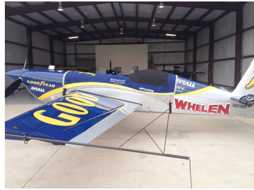
Extra 300SC with NASCAR style custom cover