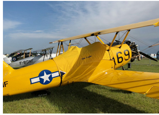
Naval Aircraft Factory N3N Canopy Cover