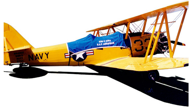
N3N Canopy Cover