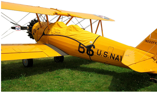
Stearman Canopy Cover