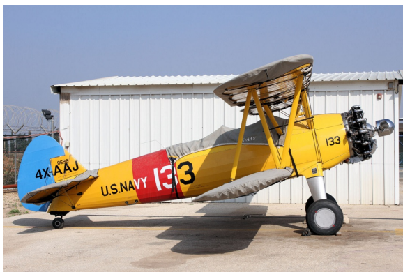
Boeing Stearman PT-13 Canopy, Wing & Horiz. Stab Covers

WINTER USE MATERIAL - Made with Solution-Dyed Polyester fabric, this option is intended for seasonal use to aid in deicing, rain mitigation, or for occasional travel. The material is lighter and more compact, but more susceptible to UV damage and may have a shorter useful life if used continuously outside than the all-year use material.