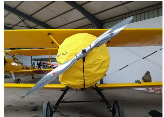
N3N Engine Cover