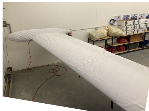
Navion Rangemaster Wing Covers