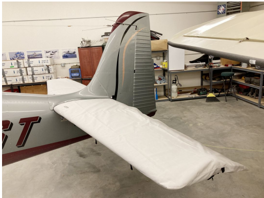
Navion Rangemaster Horizontal Stabilizer Covers

shorter useful life if used continuously outside than the all-year use material.