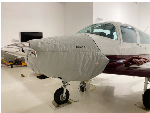
NAVION H Insulated Engine Cover

This cover type is made from Silver Acrylic Sunbrella canvas and is 100% lined with a soft and smooth microfiber. Bruce's Custom Covers developed this material combination especially for aircraft protection. The outer material is medium weight and treated for water resistance, UV resistance and anti-static buildup. The inner lining is a very soft and smooth microfiber to prevent scratching. The material is very reflective, and tests show that the cabin interior temperature can be reduced to near-ambient temperature on the hottest of days. It is water, ice and snow repellent, yet breathable to allow moisture to escape from between the cover and the aircraft surface.