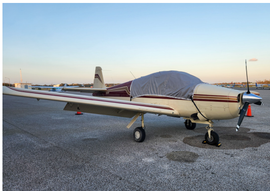
Navion Rangemaster Travel Cover, Light Weight Canopy Cover, (Super Slope windshield)