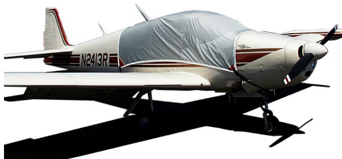
Covers & Plugs for the Navion Rangemaster