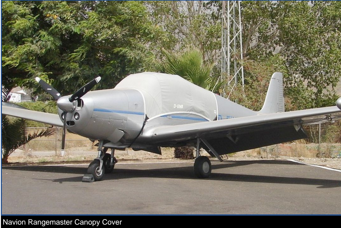
Navion Rangemaster Canopy Cover