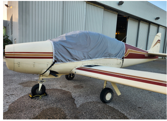
Navion Rangemaster Travel Cover, Light Weight Canopy Cover, Navion Rangemaster Travel Cover, Light Weight Canopy Cover, (Super Slope windshield) (Super Slope windshield)