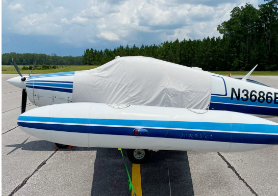
Navion Rangemaster Extended Canopy Cover

This cover type is made from Silver Acrylic Sunbrella canvas and is 100% lined with a soft and smooth microfiber. Bruce's Custom Covers developed this material combination especially for aircraft protection. The outer material is medium weight and treated for water resistance, UV resistance and anti-static buildup. The inner lining is a very soft and smooth microfiber to prevent scratching. The material is very reflective, and tests show that the cabin interior temperature can be reduced to near-ambient temperature on the hottest of days. It is water, ice and snow repellent, yet breathable to allow moisture to escape from between the cover and the aircraft surface.