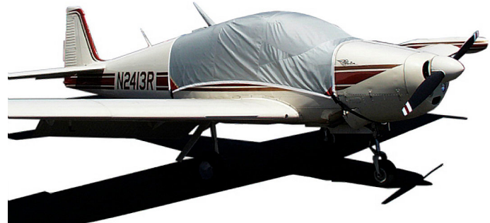
Covers & Plugs for the Navion Rangemaster