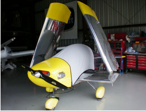
Onex Flyaway Cover

Travel Covers are made with Silver Solution-Dyed Polyester fabric and only lined over the windshield to save weight. The material is lightweight and more compact for easy stowage in the aircraft. The polyester material is water resistant, but only intended for occasional use outside. We also have an ultra lightweight material available for fitted hangar dust covers. For daily outdoor use, the non-travel Sunbrella Cover is the best choice.