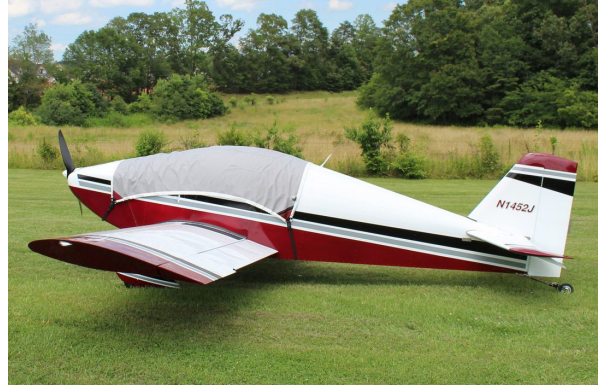
OneX Canopy Cover