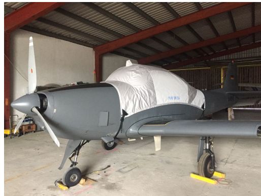
Piaggio P149D Canopy Cover