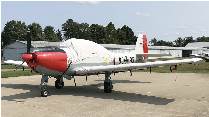
Focke Wulf F149 Canopy Cover, Wing Covers, Engine Plugs

Engine Inlet Plugs are custom fit for your Piaggio P-149 intakes, made with heavy-duty vinyl material, and stuffed with a single block of sculpted urethane foam. Each plug has a zipper that allows the foam to be removed and dried if necessary. Engine plugs have warning flags that are visible from the cockpit or 'remove before flight' streamers sewn onto the face of the plugs. Most plugs are imprinted with the aircraft registration number in black for an extra charge. Storage bag NOT included. Engine plugs may be inserted after flight when the engine is still warm. Engine Inlet Plugs are commonly referred to as Cowl Plugs, Intake Plugs, Cowl Blocks, Engine Blocks, and Engine Bunges.