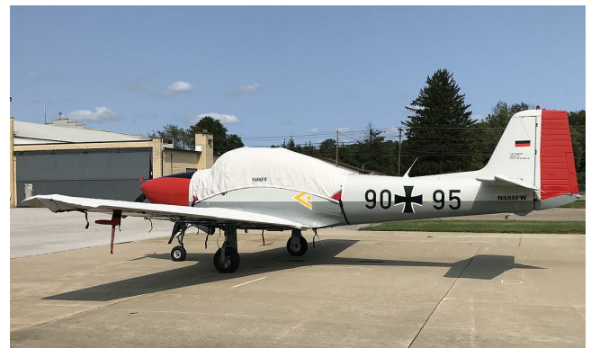
Focke Wulf F149 Canopy Cover, Wing Covers