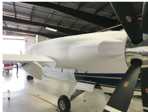
Wing Covers &amp; Empennage Cover (illustration)