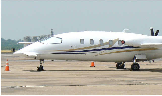
Piaggio Avanti P180 Cockpit Heatshields

Cockpit Heatshields are interior sunshades for the aircraft's cockpit. The product is a unique composite of closed-cell foam with a silver mylar finish. The semi-rigid design is stiff enough to stand inside the window framing. The set folds up flat and is easily stored in the included storage sleeve. Some designs may require velcro and suction cups. A Heatshield is an excellent short-term remedy for cockpit overheating, but an external fabric cover is more effective for long-term protection.