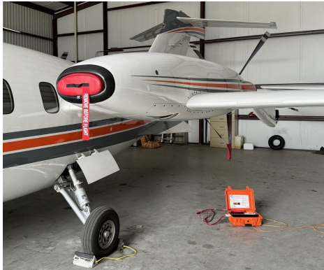
Piaggio P180 Engine Inlet Plugs

Engine Inlet Plugs are custom fit for your Piaggio Avanti P180 intakes, made with heavy-duty vinyl material, and stuffed with a single block of sculpted urethane foam. Each plug has a zipper that allows the foam to be removed and dried if necessary. Engine plugs have warning flags that are visible from the cockpit or 'remove before flight' streamers sewn onto the face of the plugs. Most plugs are imprinted with the aircraft registration number in black for an extra charge. Storage bag NOT included. Engine plugs may be inserted after flight when the engine is still warm. Engine Inlet Plugs are commonly referred to as Cowl Plugs, Intake Plugs, Cowl Blocks, Engine Blocks, and Engine Bungs.