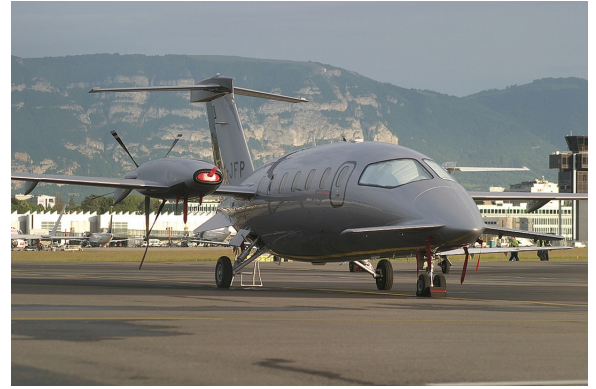
Piaggio 180 Cockpit HeatShields