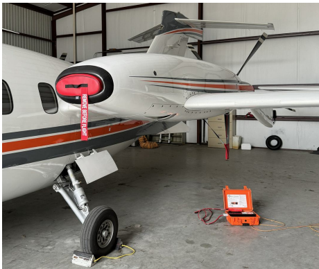
Piaggio P180 Engine Inlet Plugs

Engine Inlet Plugs are custom fit for your Piaggio Avanti P180 intakes, made with heavy-duty vinyl material, and stuffed with a single block of sculpted urethane foam. Each plug has a zipper that allows the foam to be removed and dried if necessary. Engine plugs have warning flags that are visible from the cockpit or 'remove before flight' streamers sewn onto the face of the plugs. Most plugs are imprinted with the aircraft registration number in black for an extra charge. Storage bag NOT included. Engine plugs may be inserted after flight when the engine is still warm. Engine Inlet Plugs are commonly referred to as Cowl Plugs, Intake Plugs, Cowl Blocks, Engine Blocks, and Engine Bungs.