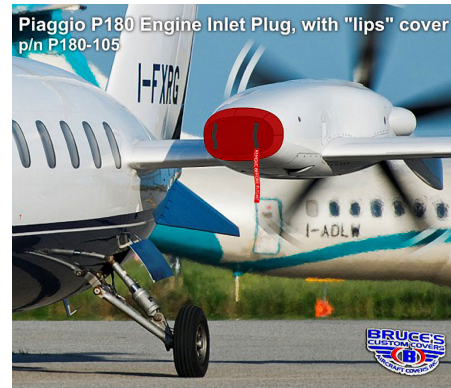
Piaggio 180 Engine Inlet Plugs with extension to cover "lips"