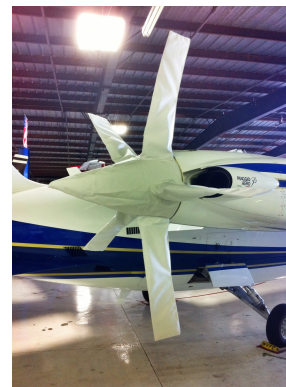
Piaggio 180 5-Blade Prop/Hub Cover