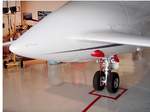
Piaggio 180 Pitot & Rosemount Covers