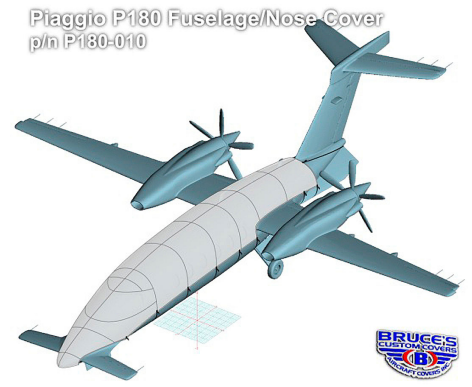
Piaggio 180 Fuselage/Nose Cover