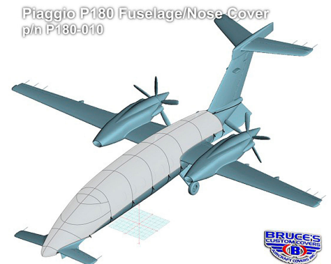
Piaggio 180 Fuselage/Nose Cover