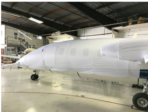
Piaggio P180 Fuselage/Canard Cover & Wing/Engine Covers (test fit covers)

Travel Covers are made with Silver Solution-Dyed Polyester fabric and only lined over the windshield to save weight. The material is lightweight and more compact for easy stowage in the aircraft. The polyester material is water resistant, but only intended for occasional use outside. We also have an ultra lightweight material available for fitted hangar dust covers. For daily outdoor use, the non-travel Sunbrella Cover is the best choice.