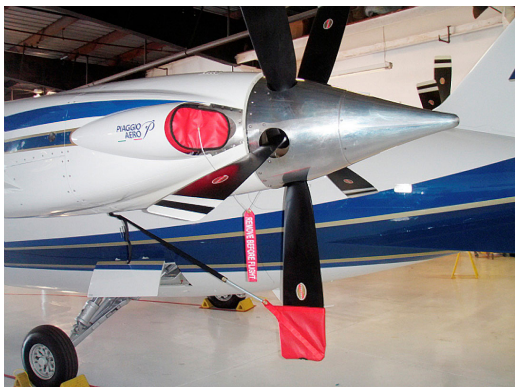
Piaggio 180 Exhaust Covers, Prop Ties

This cover type is made from Silver Acrylic Sunbrella canvas and is 100% lined with a soft and smooth microfiber. Bruce's Custom Covers developed this material combination especially for aircraft protection. The outer material is medium weight and treated for water resistance, UV resistance and anti-static buildup. The inner lining is a very soft and smooth microfiber to prevent scratching. The material is very reflective, and tests show that the cabin interior temperature can be reduced to near-ambient temperature on the hottest of days. It is water, ice and snow repellent, yet breathable to allow moisture to escape from between the cover and the aircraft surface.