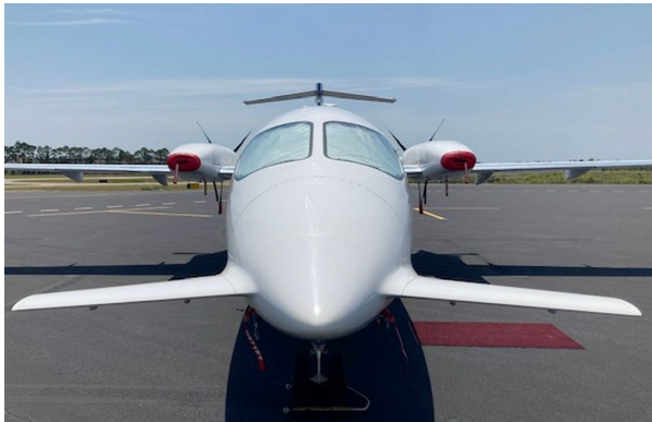
Piaggio P180 Cockpit HeatShields,

Cockpit Heatshields are interior sunshades for the aircraft's cockpit. The product is a unique composite of closed-cell foam with a silver mylar finish. The semi-rigid design is stiff enough to stand inside the window framing. The set folds up flat and is easily stored in the included storage sleeve. Some designs may require velcro and suction cups. A Heatshield is an excellent short-term remedy for cockpit overheating, but an external fabric cover is more effective for long-term protection.