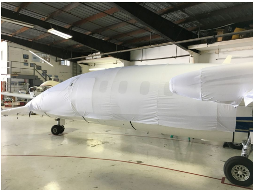
Piaggio P180 Fuselage/Canard Cover & Wing/Engine Covers (test fit covers) Piaggio P180 Fuselage/Canard Cover & Wing/Engine Covers (test fit covers)