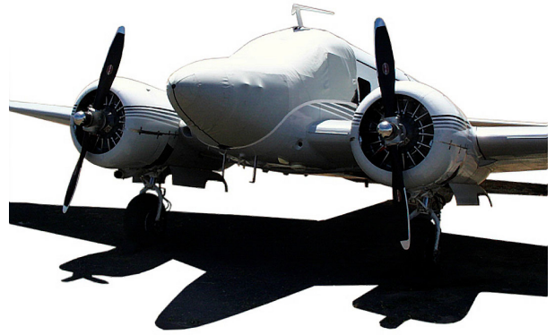
Beech 18 Cockpit/Nose Cover