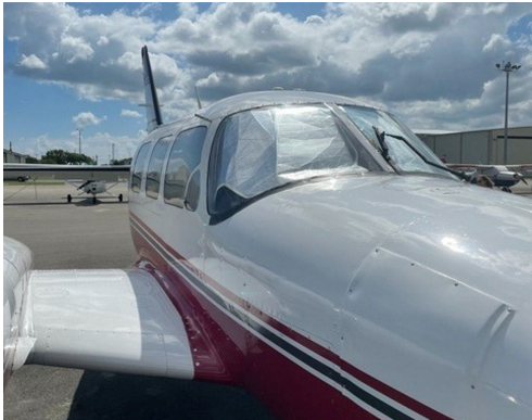
Piper PA-31 Models Cockpit HeatShields

Cockpit Heatshields are interior sunshades for the aircraft's cockpit. The product is a unique composite of closed-cell foam with a silver mylar finish. The semi-rigid design is stiff enough to stand inside the window framing. The set folds up flat and is easily stored in the included storage sleeve. Some designs may require velcro and suction cups. A Heatshield is an excellent short-term remedy for cockpit overheating, but an external fabric cover is more effective for long-term protection.