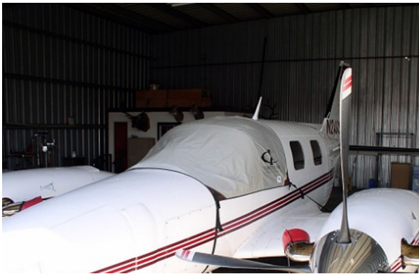
Piper Cheyenne Cockpit Cover