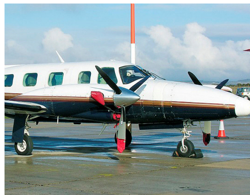
Piper Cheyenne IIXL Prop Tie/Exhaust Covers, Intake Plugs