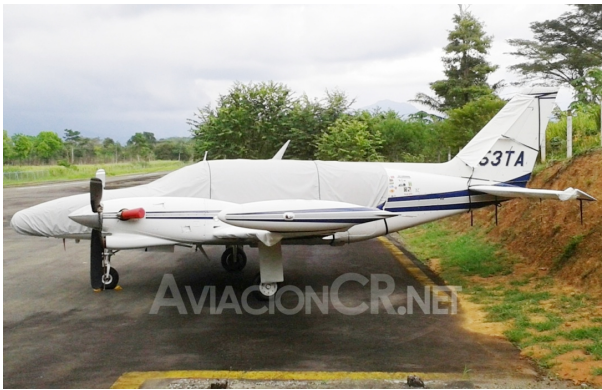
Piper Cheyenne Canopy/Nose Cover

This cover type is made from Silver Acrylic Sunbrella canvas and is 100% lined with a soft and smooth microfiber. Bruce's Custom Covers developed this material combination especially for aircraft protection. The outer material is medium weight and treated for water resistance, UV resistance and anti-static buildup. The inner lining is a very soft and smooth microfiber to prevent scratching. The material is very reflective, and tests show that the cabin interior temperature can be reduced to near-ambient temperature on the hottest of days. It is water, ice and snow repellent, yet breathable to allow moisture to escape from between the cover and the aircraft surface.