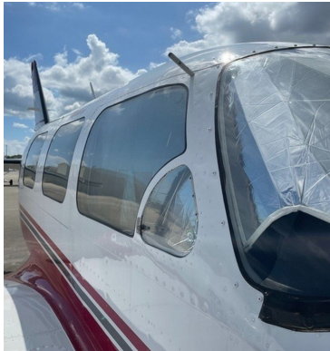
Piper PA-31 Models Cockpit HeatShields