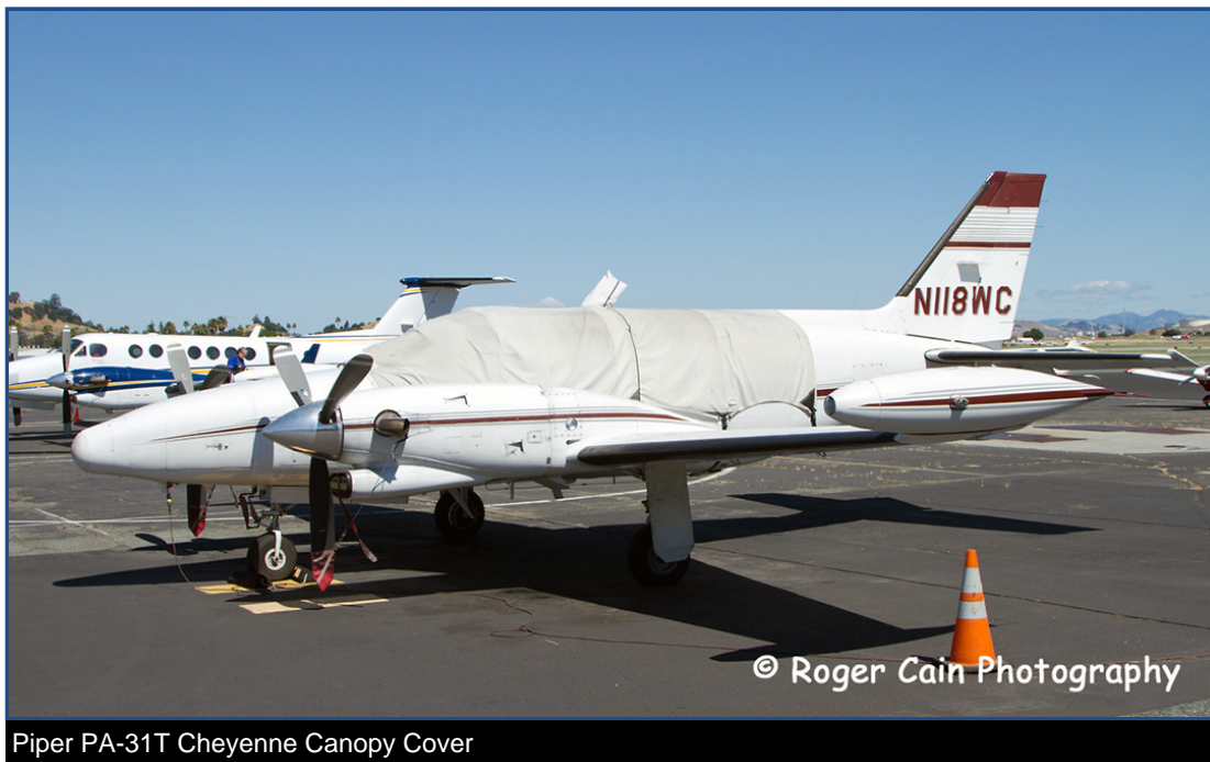
Piper PA-31T Cheyenne Canopy Cover