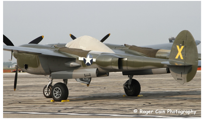
P38 Lightning Canopy Cover (snap-on type)